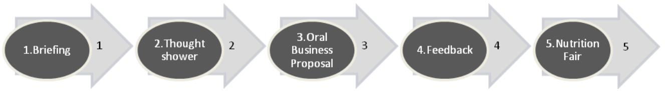
The student learning journey