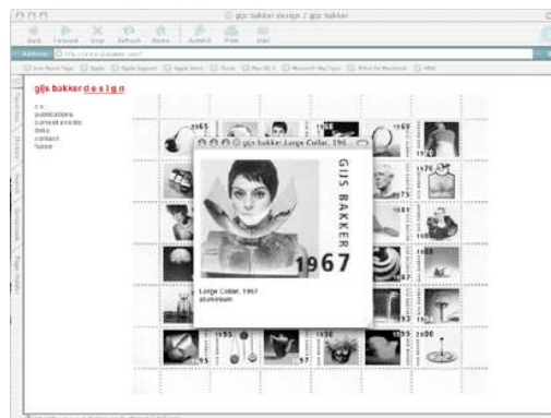
Fig.1. Gijs Bakker 1967 'Large Collar' Aluminium.

In the 1960s 'New Jewellery' movement makers such as Emmy Van Leersum and Gijs Bakker went far to establish the basis of how we perceive the breadth of the potential role of contemporary jewellery today. They protested against the use of expensive materials, limited translation of the meanings jewellery could represent, conservatism of form and placement on or relationship to the body. (Fig.1)