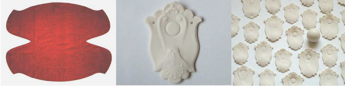
Fig.7 Jayne Wallace 2004 'Traces'

“Traces’ (Fig.7), made for one of the participants; a jeweller who doesn’t wear jewellery, is about a discussion around jewellery and how it often functions as objects we don’t wear, but that hold strong attachments for us, something to pass on from generation to generation. The piece is made from a porcelain pearl, a series of porcelain clasps and a piece of velvet resembling the inside of a traditional necklace case, showing the contours, folds and hinges as etched lines on the surface of the fabric.