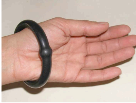
Fig.2 Otto Künzli 1980 'Gold Makes Blind' Armband. Rubber, gold.

The piece consists of a black rubber armband completely concealing a gold ball. As viewers we must consider whether we believe there is a gold ball within the piece; if so, do we perceive the piece to be of greater value even though the gold is hidden? The piece also invites us to consider the way gold bullion is stored in underground vaults, protecting the world economy and reflect on the importance of South Africa in gold production (where apartheid was still in operation), and question our willingness to use the products of such regimes.