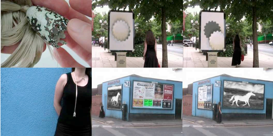
Fig.6 Jayne Wallace 2004 'Sometimes'

"Sometimes..." (Fig.6) is a necklace, made from enamelled, etched copper and synthetic silk. The form and digital potential of the piece refer to objects, memories, human connections and experiences, which are described as meaningful by the participant.