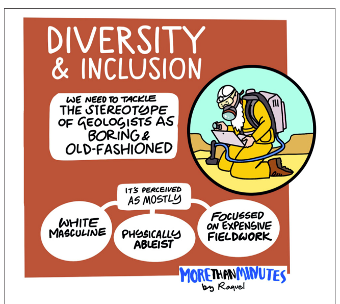
FIGURE 4 | A graphical interpretation of the fourth theme "Diversity and inclusion."