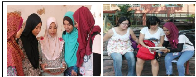
Figure 5: A group of girls and a family are evaluating AR@Melaka

Figure 6 shows an example of the screenshot of the AR@Melaka mobile AR application. The prototype provides various elements of enjoyable informal learning experience aspects such as text, image, audio, sound, animation, and video. The application also provides layered information, one-tap access for frequent menu, clues for scene with augmented content, and quick buttons to go to main menu. In addition, in term of interface, a big size of font, enough contrast between text and background, appropriate size of content were also included. Users could also save and share information to social media, show nearby interested places and recommended route to site, request direction for destination, language and distance range, and conduct a multiple choice quiz. All of these relate to mindfulness theory that allows visitor to choose enjoyable and informative contents, and enable learning by recalling knowledge of visitors through series of questions.