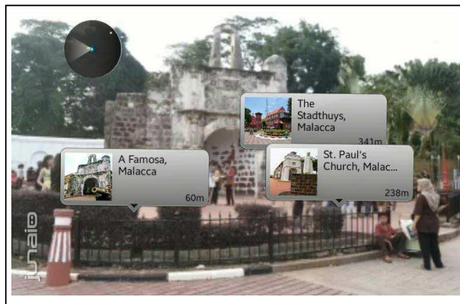
Figure 6: Screenshot of AR@Melaka at AFamosa