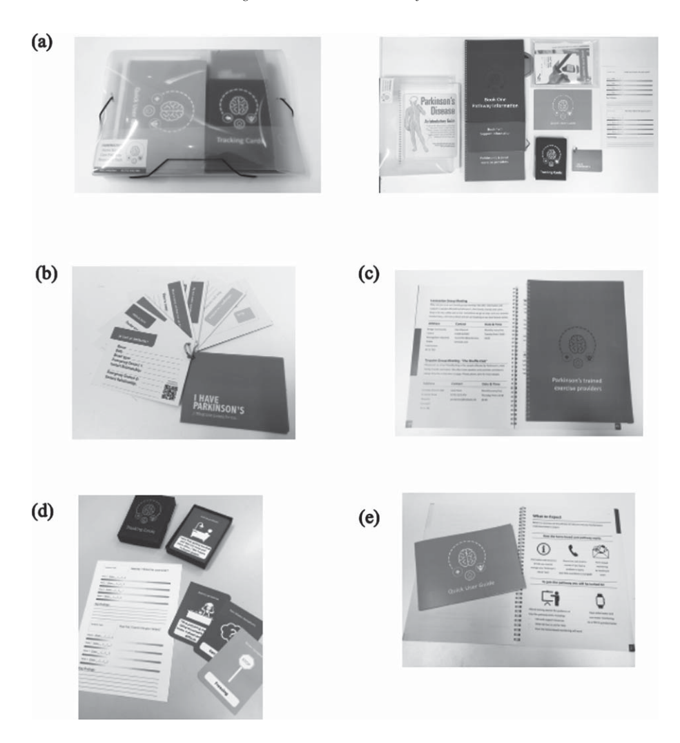
Fig. 3. Home-Based Care resource pack. (a) The Home-Based Care Pathway pack; (b) Parkinson's patient passport; (c) Service and local information; (d) A card deck to support self-reflection; (e) A self-management support and general information package. The pack included information about Parkinson's service provision and support available for PwP and care partner; details of a single point of contact; information about Parkinson's disease; information and guidance for symptom monitoring and management; lifestyle advice; a Parkinson's patient passport to capture key aspects of Parkinson's important to the PwP.

(MDS-UPDRS II)), the Non Motor Symptoms Questionnaire (NMSQ), the Parkinson's Disease Sleep Scale 2 (PDSS2), and the Hospital Anxiety and Depression Scale (HADS). A bespoke questionnaire on medications and the main concerns of PwP and their care partners was also created (see Questionnaire 1, Supplementary Material).