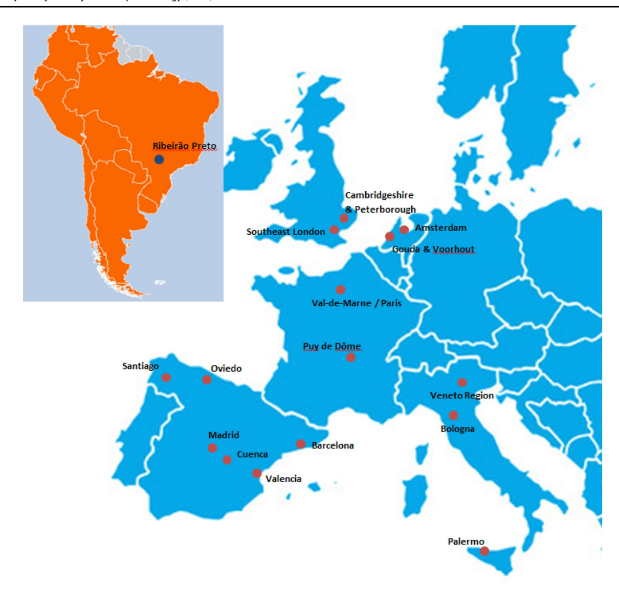
Fig. 1 Map of EU-GEI settings for the incidence and case-control Work Package

added data from the Veneto region, Italy, collected as part of an earlier study [the Psychosis Incident Cohort Outcome Study (PICOS); 2005–2007], but with sufficiently similar methods to be pooled with that collected for this study. The incidence sample comprised 2774 individuals with a first episode of psychosis. Of these, 1519 were approached, and 1130 were consented and assessed (41% of the total incidence sample). Reasons for non-participation among cases who were approached were refusal to participate, language barriers, and exclusion after consenting as they did not meet the age inclusion criteria. In addition, 1497 controls were recruited and assessed.