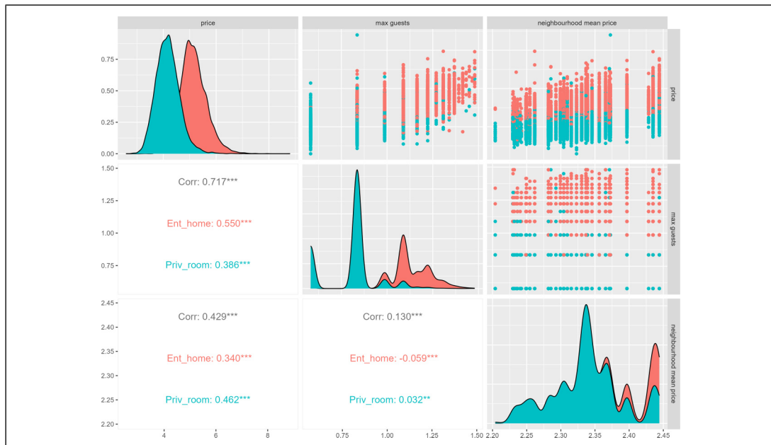
Figure 1. Variables in the landlord model (transformed data) showing: a smoothed empirical density plot of every variable (diagonal entries); every variable plotted against every other (upper right off diagonal); and the respective Pearson correlations (lower left). Response variable (occupancy rate) is on the top row. Entire homes (pink); room in a home (turquoise).

Prices and occupancy rate were available for the period 1 June 2017 to 31 May 2018. Variables indicated * were calculated.