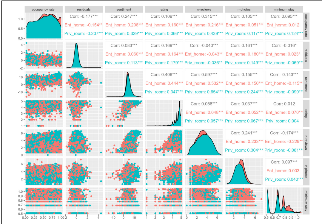
Figure 2. Variables in the visitor model (transformed data) showing: a smoothed empirical density plot of every variable (diagonal entries); every variable plotted against every other (upper right off diagonal); and the respective Pearson correlations (lower left). Response variable (occupancy rate) is on the top row. Entire homes (pink); room in a home (turquoise).