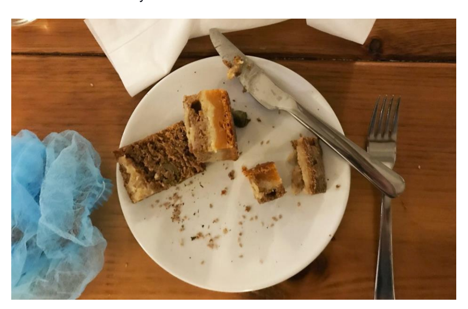
Image 3. Koski, K./Citizen Surgery Collective. (2021). DermaBread 2.0 Participant Plate.

While the experience of cognitive dissonance is one of our central strategies, contemplation is an important quality and method in our work as well. Next to the concentrated focus on surgical steps, in some of our performative workshops, we are incorporating contemplative exercises and ASMR-style techniques as a code of sensitization before the actual surgery assignments. The participants are guided to "awaken" their senses, slow down and tune into their bodies by various sensory triggers and haptic movement exercises as a step-by-step protocol narrated and demonstrated by the collective.