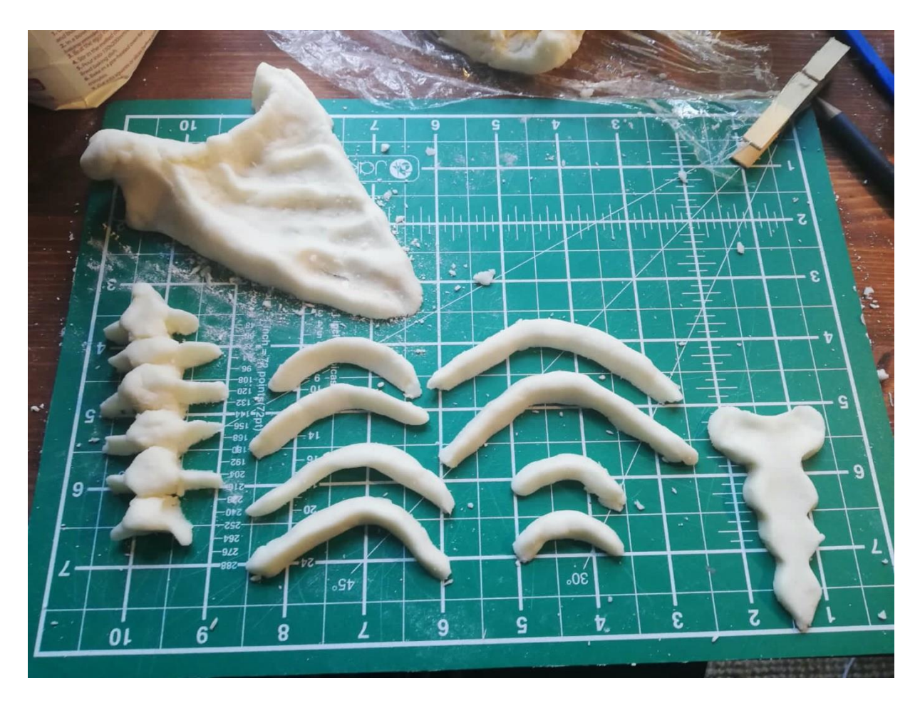
Image 6. Soula, N./Citizen Surgery Collective. (2020). Making BoneCracker.

Regarding the method of associating food with the body, our kitchen-grown victimless flesh imitates dishes which, through various techniques of cooking and baking, are constructed around a cavity of liquid such as poached eggs or a lava cake; the incision to the surface layer releases a more fluid substance, which we aim to remove by drainage. As a hybrid set of performative and screen-based bioart practices, our work draws not just from biomedical science but from art traditions with entirely different temporalities, such as oil painting. Like the body in pathology, the corpse, the edible simulator can be seen as a form of still life, the operation of which results in a "small murder"; the (projected) life is stilled, and the body has taken the character of a material object (Young, 1997). (Of course, in the context of eating animals, the still life of meat on the plate results from a big murder). The slowly progressing video and photographic "still lives" of our collective are being operatively and reversely "painted" with vegan ingredients through stages of deconstruction. However, some of our operations end with the body being put together through stitching or bone glue, for instance. This simulates the mechanics of an actual surgery. That is to say, instead of being merely dissected, the body under surgery is, in some ways, being manufactured by the sculptural practice of operations (Hirschauer, 1991).