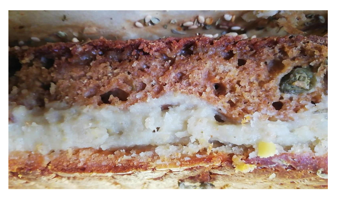
Image 5. Soula, N./Citizen Surgery Collective. (2021). DermaBread 2.0.

human body. In fact, naming the simulator in a particular way is another avenue to poke the cultural uneasiness about seeing the human body as food. The name DermaBread purposefully merges two easily identifiable elements that do not belong together, the skin and bread. Moreover, in our participatory performances, the dialogue addresses the gastronomic language that disguises violence (even though it uses metaphors such as "skin of the milk"); we are altering the perception of food during tasting. Our participant responses reflect the power language has to change the sensory perception, such as the taste and mouthfeel of the ingredients: the eating experience is skewed by calling the white layer of the DermaBread 2.0 fat. However, language and voice are not the only ways our mouths produce meaning in the tutorials. We bring the sounds of chewing to the table, too, a potentially disgust-evoking experience for those with selective sound sensitivity syndrome, misophonia, triggered here by sounds of eating (Cavanna & Seri, 2015). In terms of sensory subtleties, however, speaking with food in the mouth communicates the simulator's moist level to a careful listener.