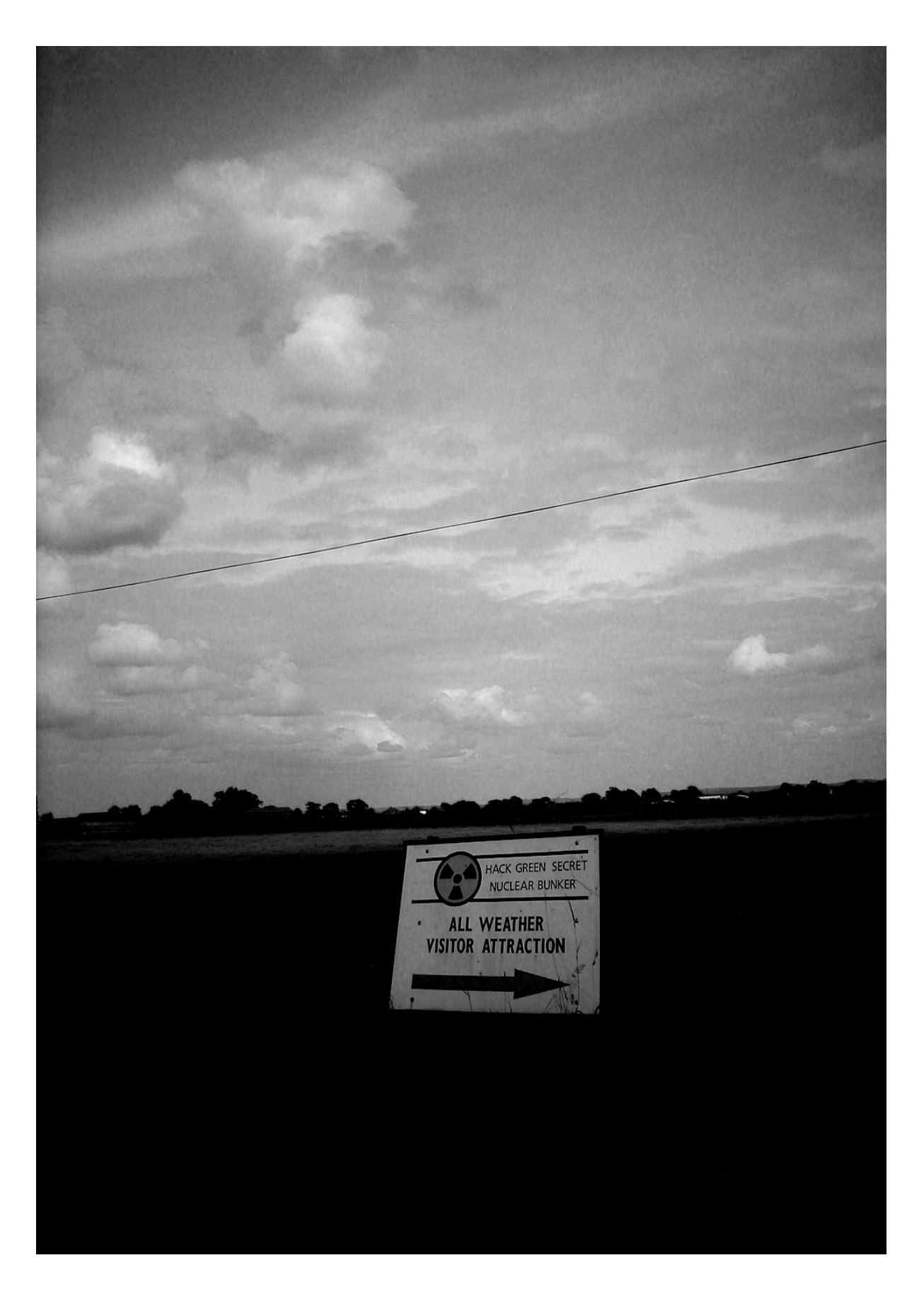
New clear skies?