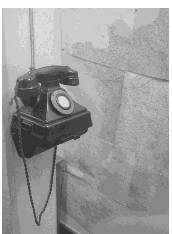
Traces of dwelling – Cabinet War Rooms and Hack Green RSG