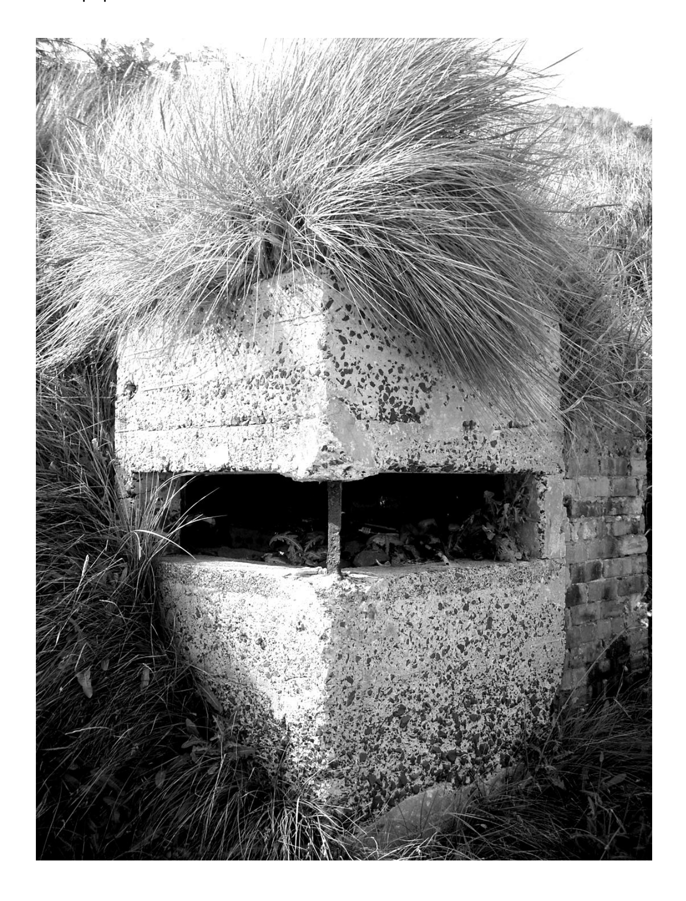
Second World War coastal pillbox, Northumberland (photo in the style of Virilio 2009).