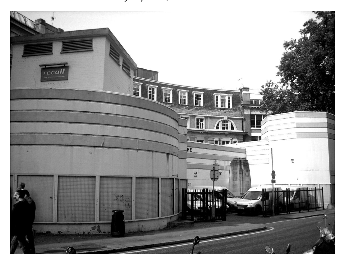
Eisenhower's 'deep shelter', Goodge Street, London – now Channel 4's archive.