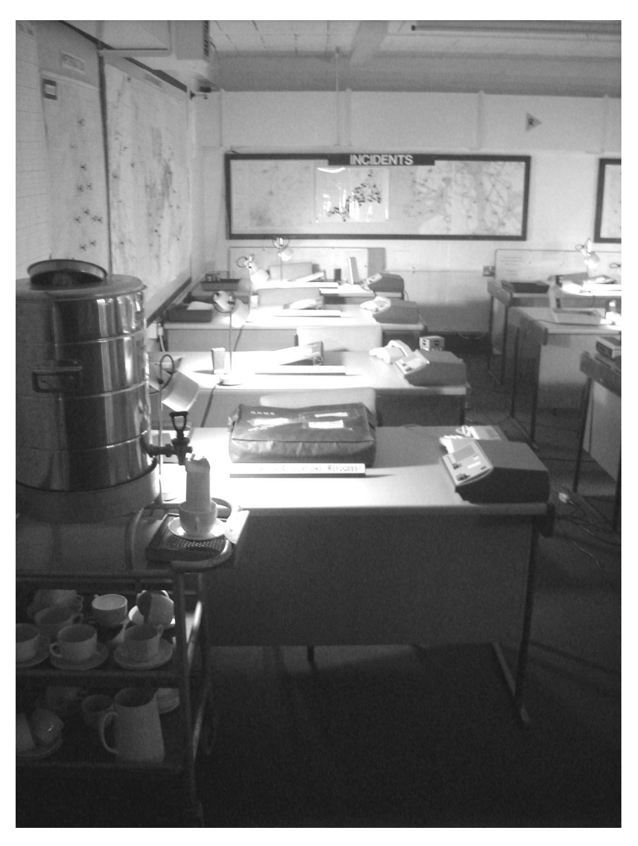
Incident control desks, Hack Green RSG