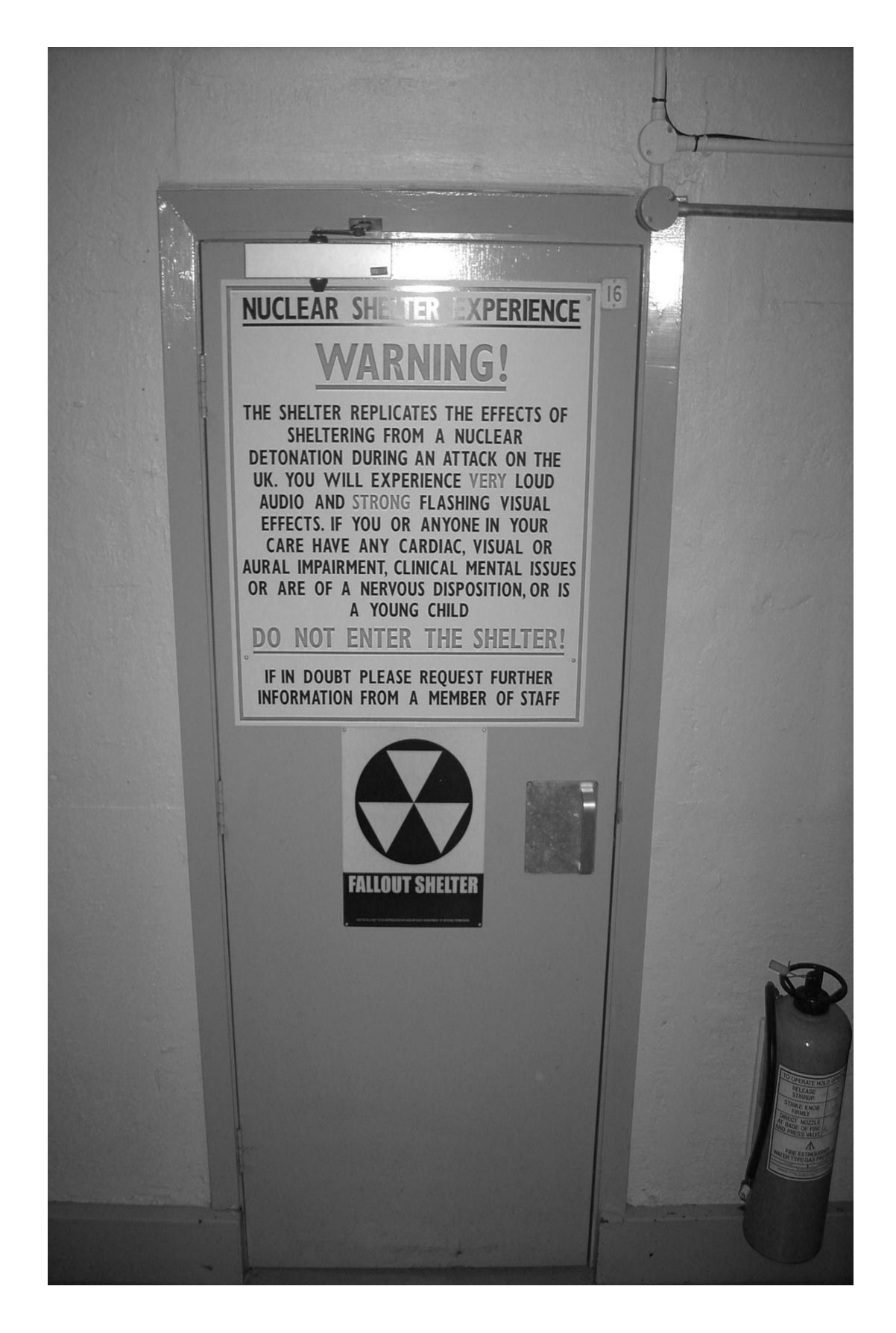
Awaiting the "abstract surprise moments of modern war" (Virilio 1989, 48)

Hack Green RSG's nuclear strike simulator