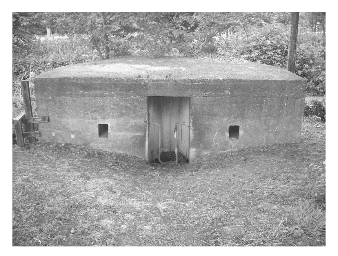
Entry to pillbox, Northumberland.