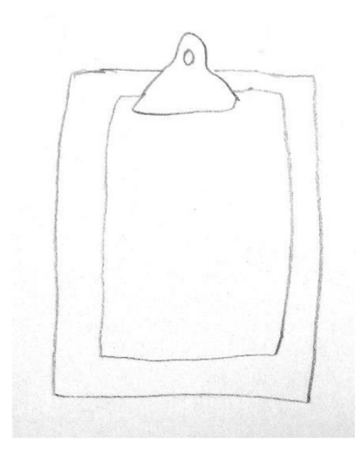
Figure 2. The clipboard to me represents the fact that I'm not a person in the eyes of so many of the professionals, I'm just a problem and a problem to be fixed medically and anything else that gets in the way of that - me having a personality ... - it gets in the way (Samantha). © Samantha (a pseudonym). Reuse not permitted.

and an appreciation of the NHS for successfully treating their breast cancer meant that often participants were willing to accept its inadequacies in detecting and treating BTL. In contrast, participants frequently complimented the care and expertise displayed by staff once they were able to access a lymphoedema service. There was a sense, however, that lymphoedema services were not accorded high priority for resources and consequently could be "a bit of a battle" (Sandra) to access.