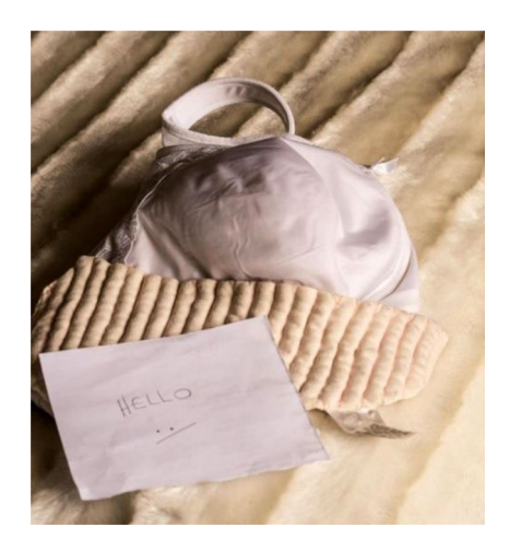
Figure 4. Saying hello to this horrible thing (Leah). \hfill\square Leah (a pseudonym). Reuse not permitted.

Figure 3. Saying goodbye to the glamorous stuff (Leah). \mbox{\sc C} Leah (a pseudonym). Reuse not permitted.