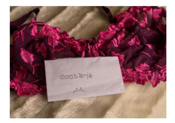
Figure 3. Saying goodbye to the glamorous stuff (Leah).

The final theme, adapting to breast or trunk lymphoedema , encompasses women's experiences of developing expertise and an ability to accommodate the condition both practically and psychologically. All participants spoke about the challenge of obtaining suitable bras: frequently they were too tight