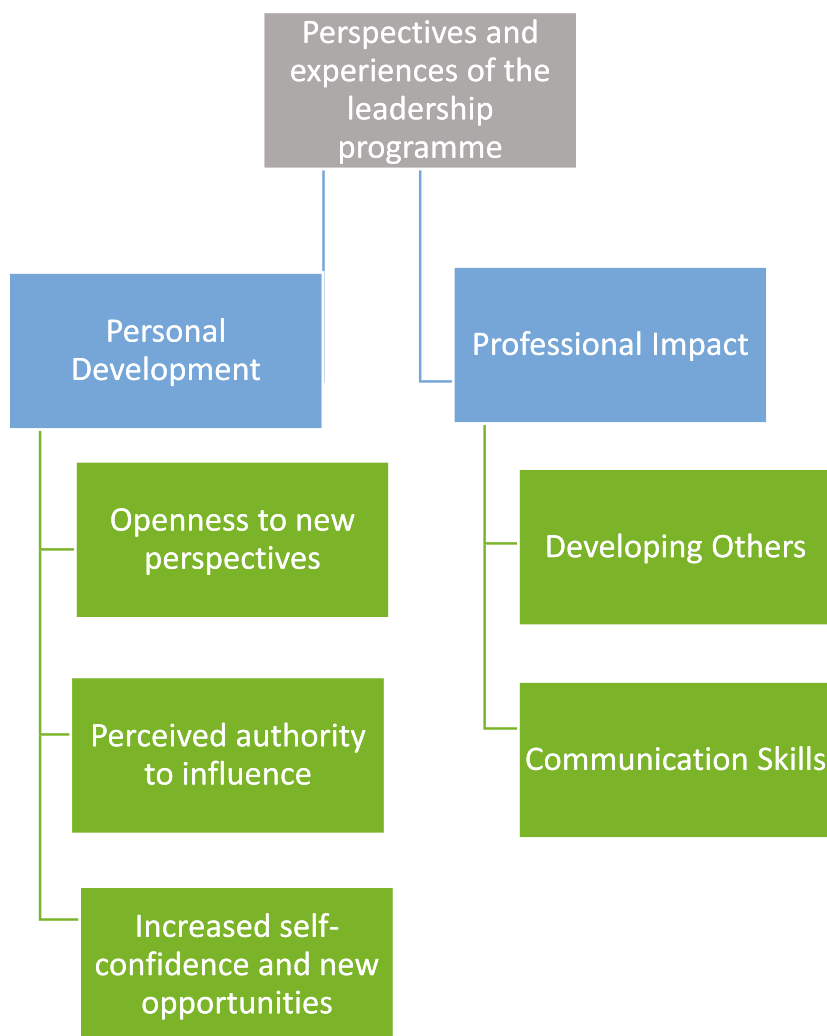
FIGURE 1 Overview of the two core themes and subthemes emerged during data analysis

Participants reflected that the design of the FNF programme, and how it had enabled them to share experiences of leadership with