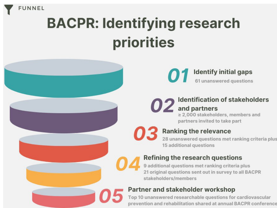
Figure 1 Summary of the findings from the five-step process. BACPR, British Association for Cardiovascular Prevention and Rehabilitation.

After refinement of these questions, a total of 30 questions (online supplemental appendix 2) were carried