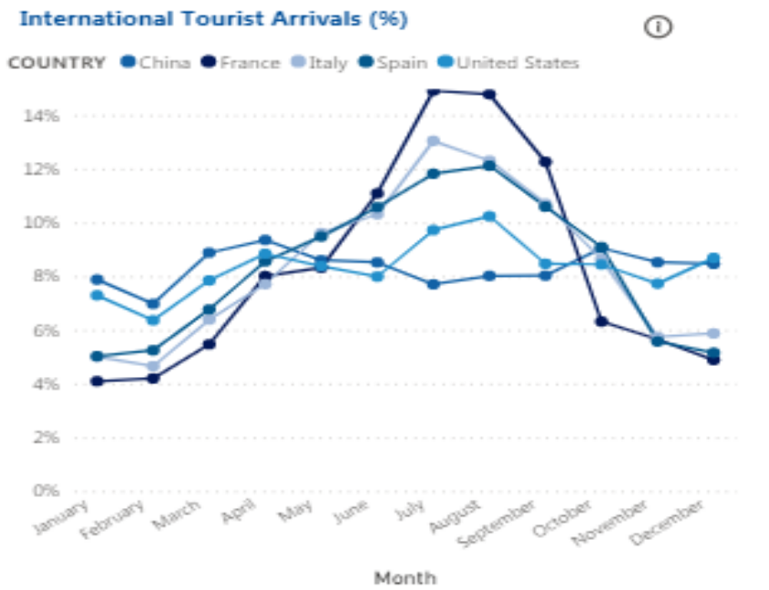
Figure 12.1: Seasonal distribution of international visitor arrivals to five major destination Countries in 2019