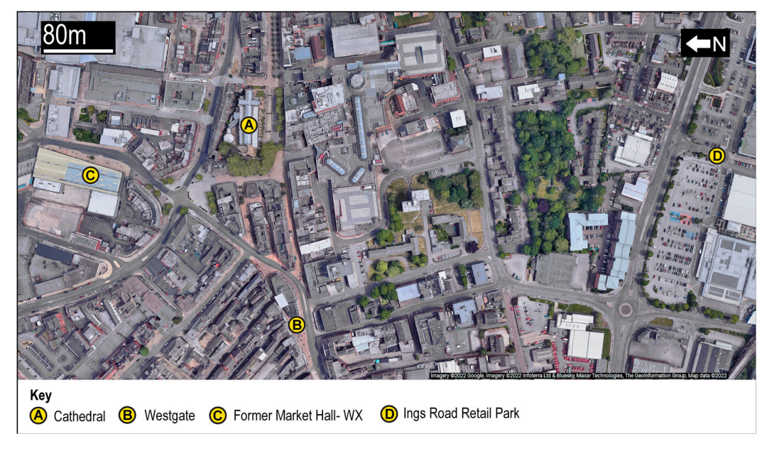
Figure 2. The central area building morphology ( Imagery from Google, 2022 ).

In contrast, studies undertaken by previous researchers, either in Wakefield<sup>11</sup> or in comparable towns and cities are examples of secondary, narrating sources that help in interpretation. A study of Urban Renaissance era master planning in Sheffield city centre helps illuminate the difficulties of implementation in a period of economic downturn.<sup>12</sup> In addition, studies of branding in other small towns and cities are useful in understanding the local counter narratives that have emerged to contest the assumptions of regeneration.<sup>13</sup>