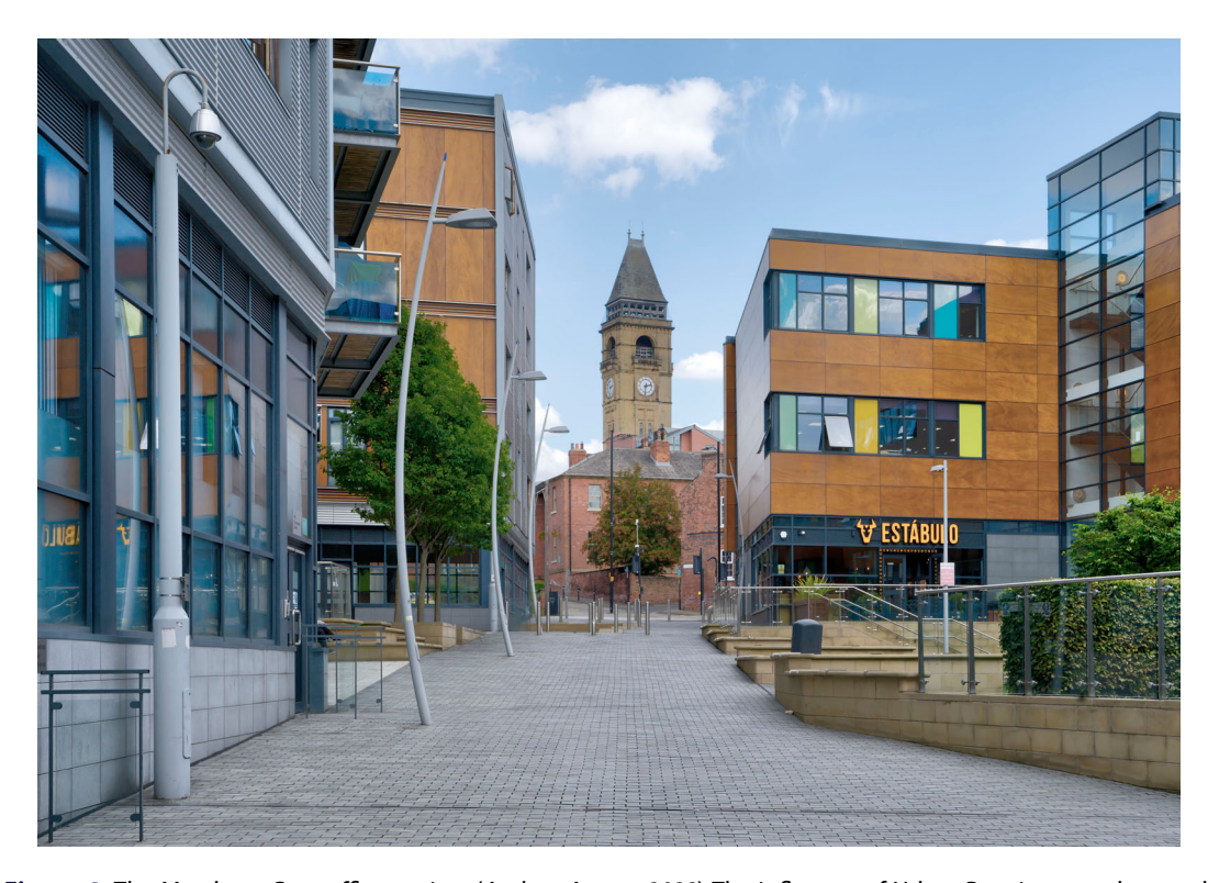
Figure 4. The Merchant Gate office project The influence of Urban Renaissance place-making is apparent in the inclusion of the small area of open space and the direction of the footpath so that it enables a view of the Town Hall tower. The offices, though well located and of good quality, have proved difficult to let.

2014, and this suggested that non-local visitors were deterred by the absence of other attractions or amenities in the immediate vicinity. <sup>85</sup> Getting to Wakefield just to see the Hepworth was not worth the effort, especially given the distance of the gallery from city centre shops and restaurants.