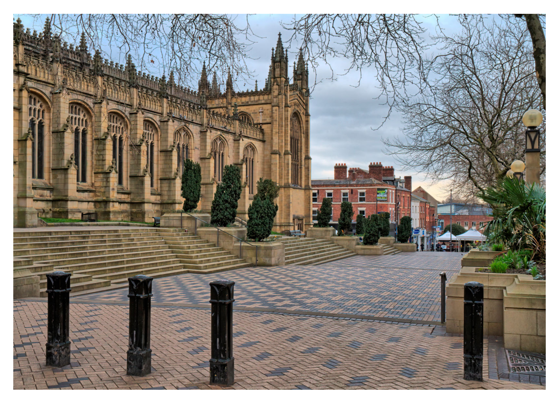
Figure 3. The Cathedral Precinct: ( Author, March 2022 ). The paved area and stone terraces are the product of the remodelling exercise by Jaray. In February of each year, the precinct hosts a food festival, celebrating the local delicacy of winter rhubarb.

publicly funded redevelopment project that would eventually lead to the Hepworth. This latter drew on contributions from the National Lottery, the Arts Council and the local Council. A fourth proposal did not go ahead. This was for mixed-use housing and green space to replace the Ings Road retail park, with the opening of a culverted stream. Instead, most of the retail park units were subject to privately funded rehabilitation, completed in 2017.<sup>75</sup> As is apparent from this example, implementation of the Area Plan depended crucially on the availability of private funding.