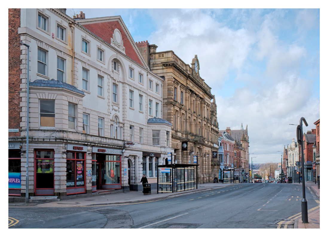
Figure 6. The upper end of Westgate. The white building on the left, Westgate Studios, offers space for working artists. Other artists' spaces are available in an annexe to Westgate Studio and in the Art House, both in side streets. Restaurants, take-aways, clubs and drinking establishments occupy the ground floor of all the buildings in view.

and are developing another, positive narrative. 91 For the moment, however, the city centre economy remains relatively 'weak' as classified by the Centre for Cities. 92