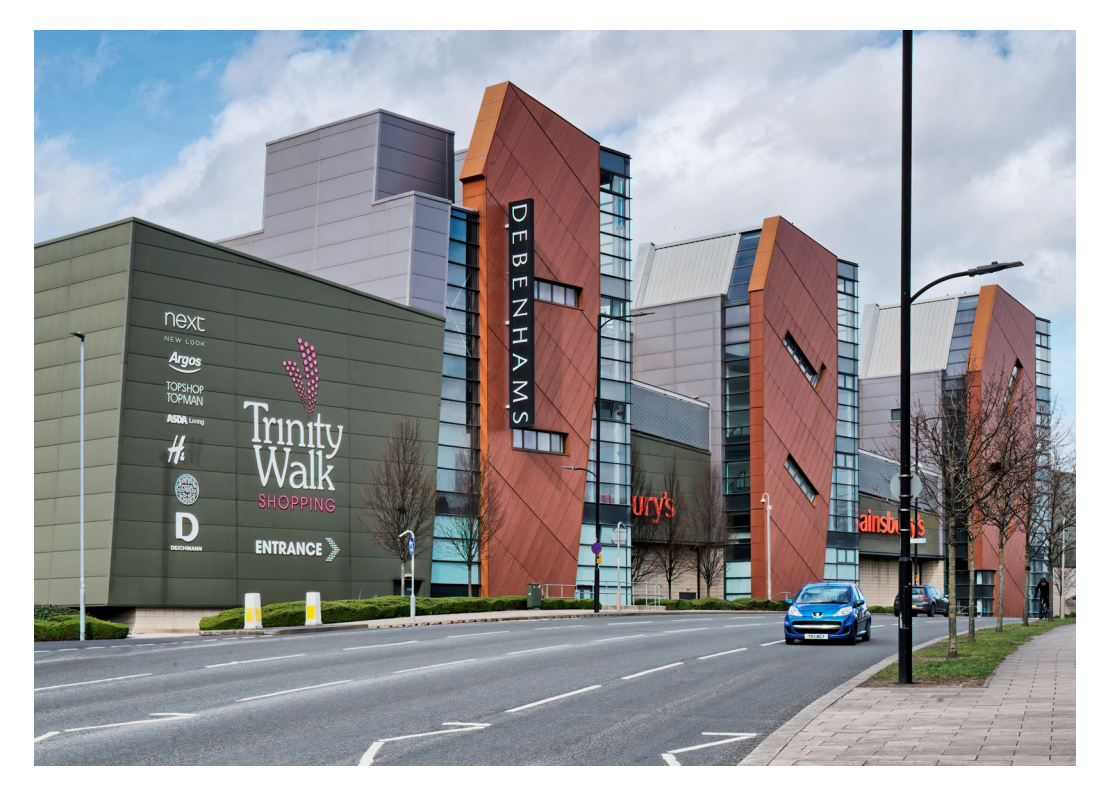
Figure 5. The 'Emerald Ring'/ inner ring road with Trinity Walk: (Author, March 2022). The road in the foreground is part of the city centre ring and was criticized in the Koetter Kim reports for severing pedestrian movement. The 'Debenhams' store is closed and vacant.

the so-called 'Westgate Run'. The traditional name of Wakefield as the 'Merrie City' is likewise associated with drinking and partying. The name itself persists in social media and has also been used in tourist promotion. However, the same reputation of the city centre as a 'wet led retail centre', namely a retail centre based on drink, has hindered efforts to attract a new cinema and family-run restaurants and, in the words of the minutes of the local Task Force, had 'in the past' 'tarnished the city'.89