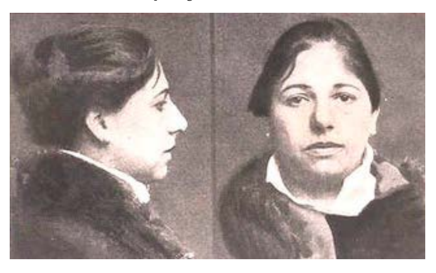
Mata Hari mugshot.

again that intelligence efforts are required. In effect, intelligence agencies justify their existence irrespective of the reality because of their self-justifying reasoning. Espionage is (re)generative, and failure is thus a necessary prerequisite for espionage's continued existence. Every failure is nothing short of a justification for further and more extensive and broader espionage.