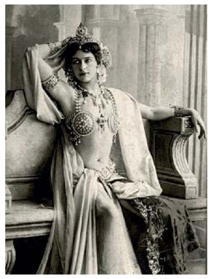
■ Mata Hari c. 1906.

Women have a long and relatively welldocumented role in espionage history. From antiquity to modern day, across culture, and in both governmental and industrial instances, women feature well. We see this in the narrative of Delilah, arguably the mythological precursor to Mata Hari; 'Delilah shines as leading lady; shamelessly seductive, she is the quintessential femme fatale' (Blyth 2017: 1). The femme fatale, while more famous for the portrayals in literature, film, theatre and art more broadly, exists beyond the artistic representation and is found throughout narratives of real life as a cultural construct. As Hanson and O'Rawe write, '[t]he femme fatale is thus read simultaneously as both entrenched cultural stereotype and yet never quite fully known: she is always beyond definition' (2010: 2). And entrenched they are. So much so that the case of Hari cannot be analysed without this consideration. The idea of