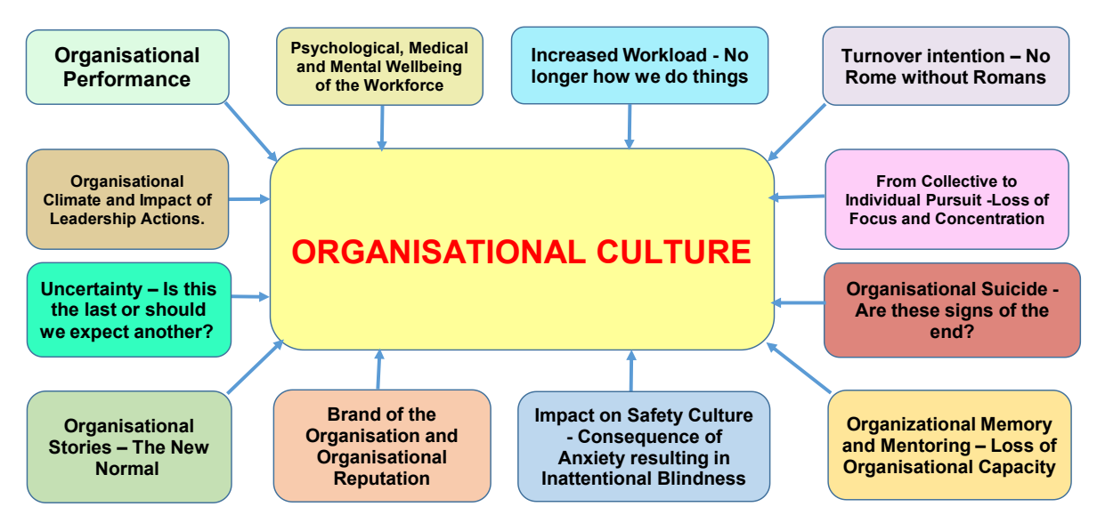
Figure 2 – Framework showing the Impact of frequent downsizing exercises on organisational culture

impact of frequent downsizing on organisational culture. The ensuing discussions will follow the areas depicted by the diagram.