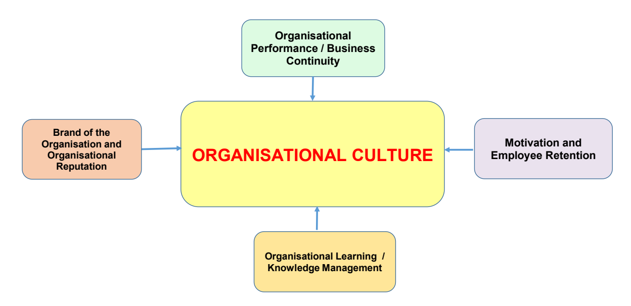
Figure 1: Initial Framework on the impact of frequent downsizing exercises on organisational culture.

Since people are the bearers and drivers of organisational culture, the impact of frequent corporate downsizing on them should indicate the organisation's future, whether they (people and the organisation) survive after the exercises or not. This understanding should give credence to the essence of this research, which is to demonstrate the impact of frequent downsizing on organisational culture. The quest will be accomplished from the interpretation of survivors' feelings (relative to the initial themes and others that will emerge during the research journey), as they will be the ones to take the organisation to the desired height afterwards. I hope that the qualitative/inductive method proposed for this exploration (as will be presented in the following chapter) helps to uncover hidden truths about the impact of frequent corporate downsizing on survivors (the drivers of the organisation's culture); and that corporate organisations will henceforth consider this when restructuring to have and operate a lean organisation for higher efficiency and profits.