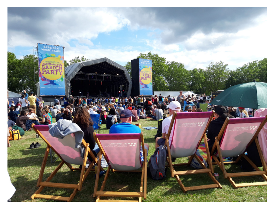
Figure 2.2: The 2019 edition of the Walthamstow Garden Party in Lloyd Park, London E17.

survey that they want to stage more events but are prevented from doing so by limited organisational capacity, low demand and unhelpful procedures. Only three Friends groups that responded to the survey did not organise any events in 2019. One group said this was because they were anticipating the start of the major redevelopment project and another stated that due to the way their park is governed, all events are organised by the city. Perhaps reflecting the different roles and functions that Friends groups may adopt, one group acted more as a campaign group that actively campaigns against inappropriate events. This opposition is useful to bear in mind as we consider commercial events.