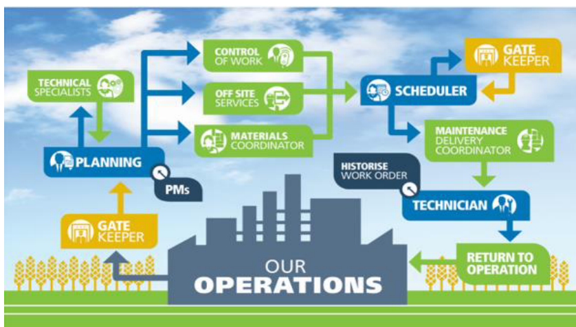
Figure 1- Bioethanol Maintenance Process

Determining the correct approach to building or rebuilding the maintenance department at the production facility was to be the vital and major task. [4] stated that the development and management of people are key in creating a productive, operating, and successful business. The section below will show how the maintenance process will operate to create a department that was able to fulfil its requirements to serve the wider operational team.