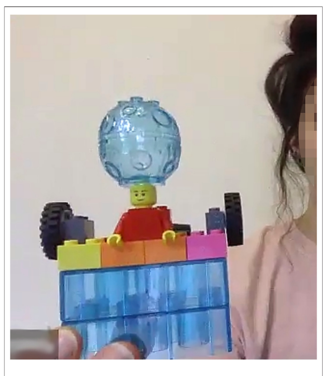
FIGURE 2 | The "big brain".

Because the second main question focused on tasks, this also included ways a robot could learn about the user's actual needs to