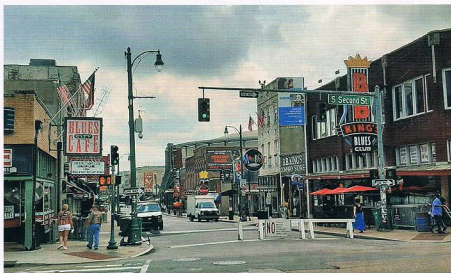
ABOVE: Beale Street in Downtown Memphis, 'Home of the Blues' and confluence of various streams of musical folklore.

Musician and music publisher WC Handy, honoured with a statue in the centre of Memphis, is reputed to have written the first blues song on Beale Street in 1909 and has been dubbed the 'Father of the Blues'. Here