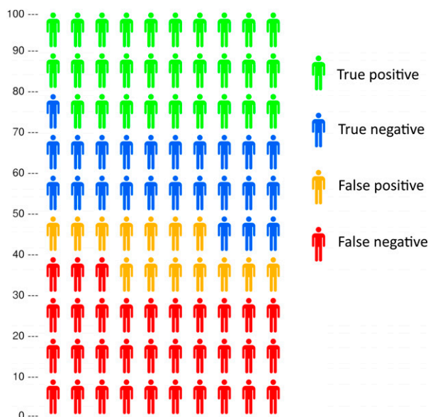
Figure 1. Diagnostic performance of the Edinburgh Claudication Questionnaire for detecting intermittent claudication.

One key methodological difference is in the type of clinician making a diagnosis in each study. Leng et al. 16