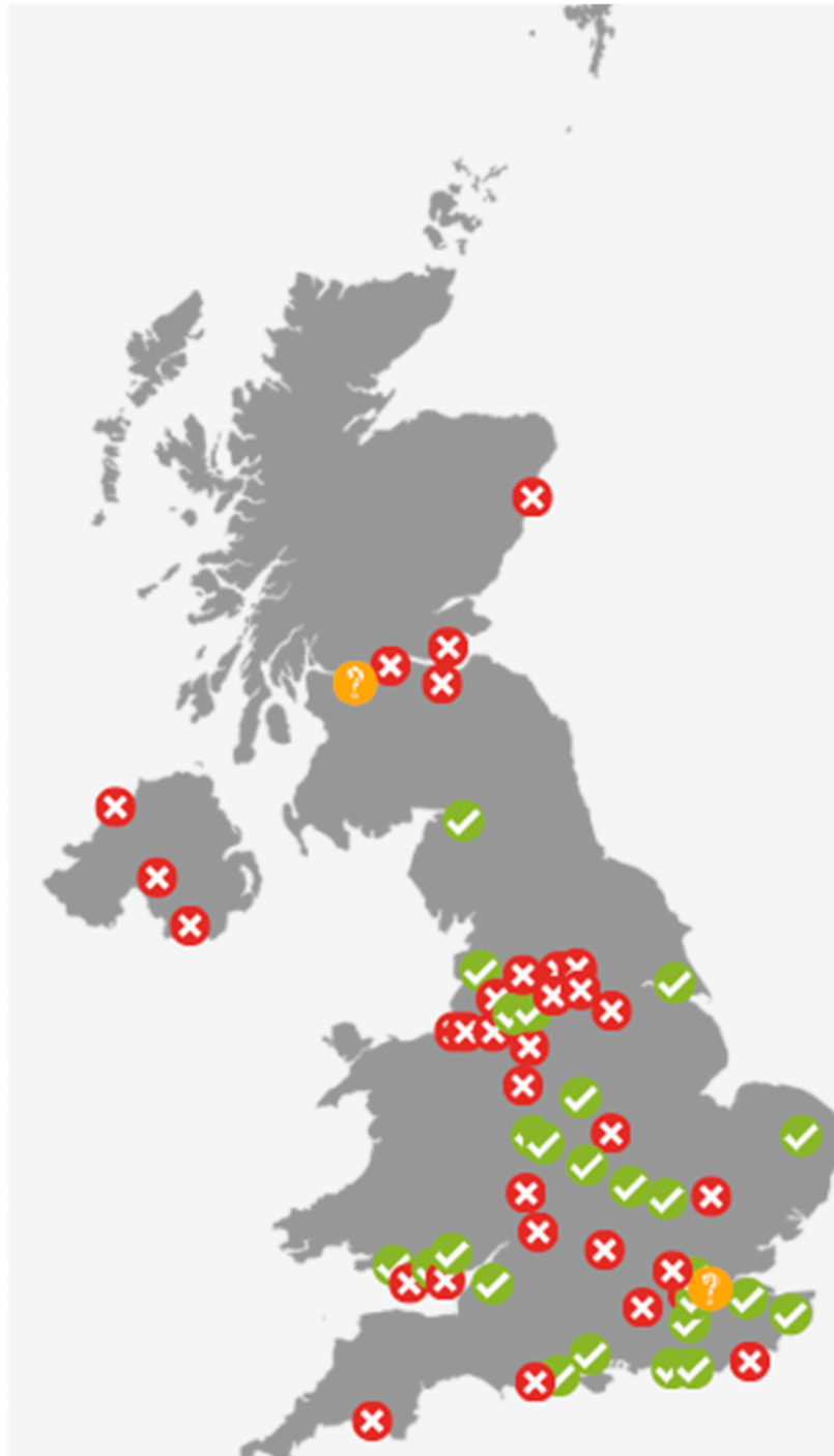
Figure 1. Overview of access to supervised exercise programmes (tick = access, cross = no access and question mark = don't know).