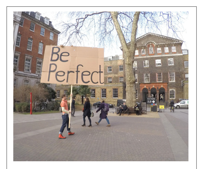
FIGURE 3 | Schrag holding "be perfect" placard from the Secret Society of Imperfect Nurses. Anthony Schrag.

by inherited assumptions about curation and its relation to education that have been articulated by those within the field. "Gallery education is typically situated at the edge" within institutional formations and is "overshadowed" by other activities (Allen, 2008, 9). While the Utopia Lab space alluded to the fluid, dialogic, intentions that lay behind New Institutionalism, the respective remits in this case were split across two rather than one curator role. In this way, they remained separate and fixed (and unequal).