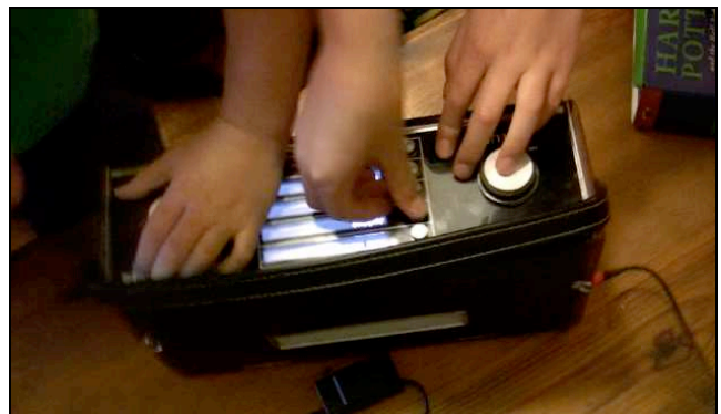
Fig. 1 Three siblings interacting with the Family Memory Radio.

We address these problems with digital mementos by exploring a new design approach. Rather than leaving digital mementos 'imprisoned' in a computer, we explore ways that digital collections can be made more accessible, interesting and better integrated into people's everyday lives. Our new designs also need to fit seamlessly into the home by appropriating familiar objects and metaphors. We explore the concept of embodied digital mementos of 'sonic souvenirs', family recordings taken during summer holidays. Our design allows these to be accessed through a familiar domestic object: a radio (Fig. 1). We shed light on the motivation, design and evaluation of devices for personal digital mementos, by studying how digital sound can engender and enhance collective family reminiscing.