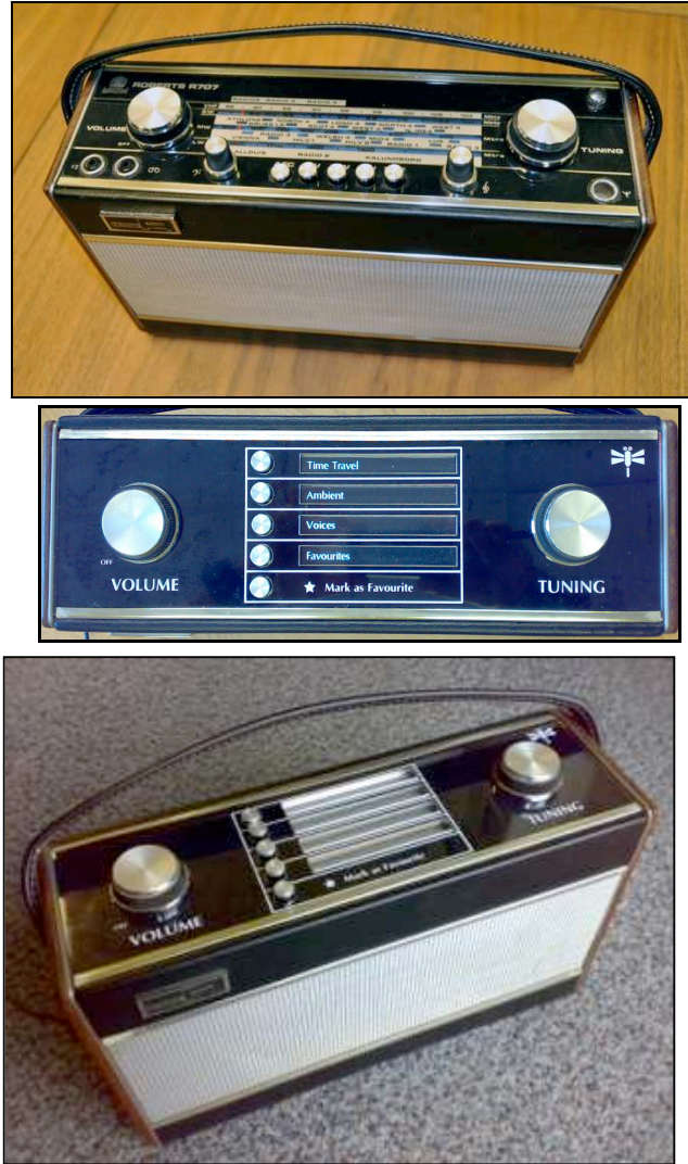
Figure 2. The original Roberts R707 (top); the redesigned FM Radio (bottom) and its interface (middle).

sound in the channel. When the FM Radio is turned off, or the channel is changed, playback of the current channel stops: when the radio is turned back on or the channel is re-selected, the play resumes from its previous position.