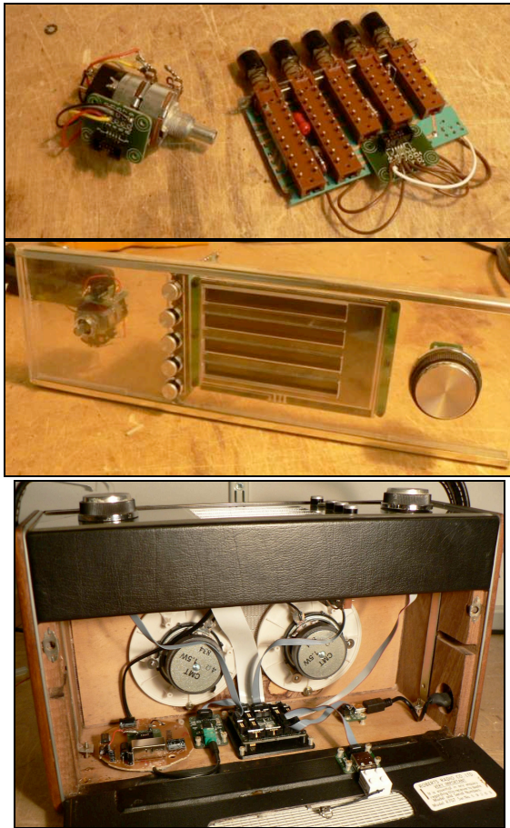
Figure 4. The digitally-enhanced original radio controls (top), the replacement control panel assembly (middle), and the assembled FM Radio (bottom)

unaware of what we had designed: we mentioned they would be asked to try out “a device” and provide some feedback. This intentional “secrecy” allowed us to capture initial impressions about the Radio and how participants first related to it.