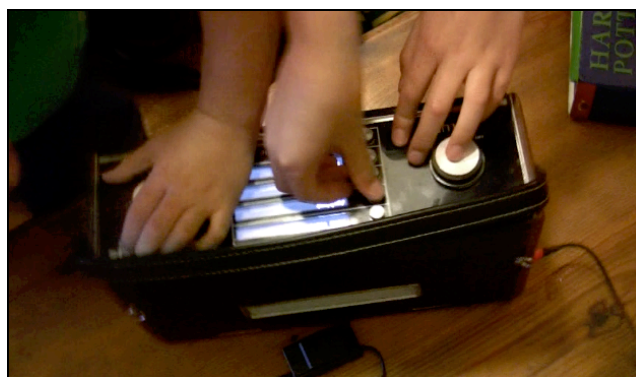
Fig. 1 Three siblings interacting with the Family Memory Radio.

We address these problems with digital mementos by exploring a new design approach. Rather than leaving digital mementos 'imprisoned' in a computer, we explore ways that digital collections can be made more accessible, interesting and better integrated into people's everyday lives. Our new designs also need to fit seamlessly into the home by appropriating familiar objects and metaphors. We explore the concept of embodied digital mementos of 'sonic souvenirs', family recordings taken during summer holidays. Our design allows these to be accessed through a familiar domestic object: a radio (Fig. 1). We shed light on the motivation, design and evaluation of devices for personal digital mementos, by studying how digital sound can engender and enhance collective family reminiscing.