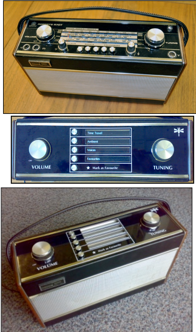
Figure 2. The original Roberts R707 (top); the redesigned FM Radio (bottom) and its interface (middle).

sound in the channel. When the FM Radio is turned off, or the channel is changed, playback of the current channel stops: when the radio is turned back on or the channel is re-selected, the play resumes from its previous position.