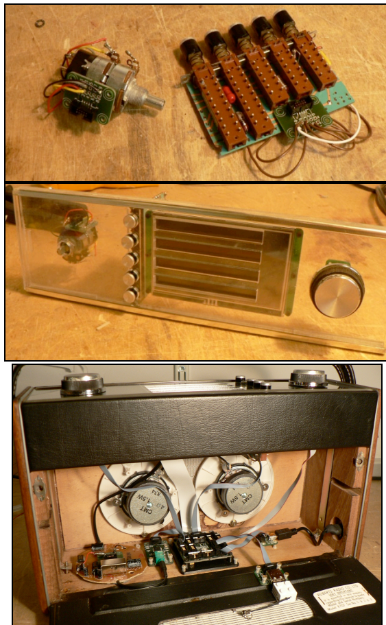
Figure 4. The digitally-enhanced original radio controls (top), the replacement control panel assembly (middle), and the assembled FM Radio (bottom)

unaware of what we had designed: we mentioned they would be asked to try out “a device” and provide some feedback. This intentional “secrecy” allowed us to capture initial impressions about the Radio and how participants first related to it.