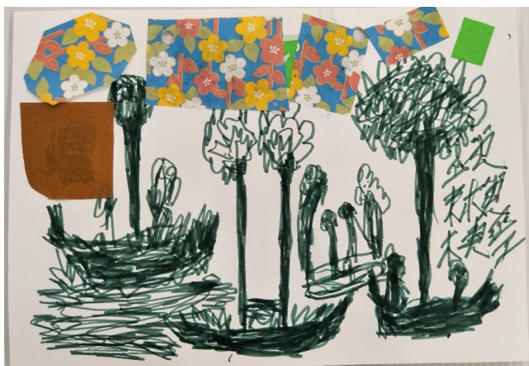
Figure 4. Lucy, Sampans (translate: wooden boat) and Trees , 2019. Collage. © Chao Min Tan 2019.

Participants not only viewed the book as a preservation of their memories, in which they could look back to remind themselves, but most of them also mentioned that they would like to share the book with their loved ones. They expressed that they wanted their loved ones to understand their life stories and what they went through: ‘Give [the book] to my child! Let them have a look at the me last time and whatever happened to me’ (Amy).