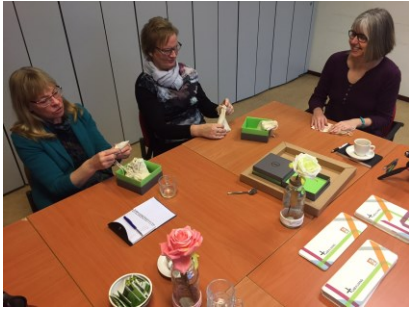
Figure 2: Co-design workshop using the exhibition in a box methodology.