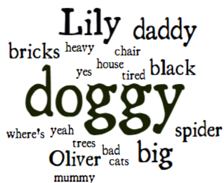
Figure 2: Words Lily uttered.

The range of words the teacher uttered during the shared digital book reading are presented in Table 1. They consisted of words used by the teacher to support learning about the story content (e.g., wolf, heavy); words used to positively encourage Lily’s engagement with the story book app (e.g., good, yes); and words used to provide navigational support when using the iPad and app (e.g., button, press). In addition, there were also some “other” words (e.g., snack, flowers) the teacher uttered that were not directly related to the story content (see Table 1).