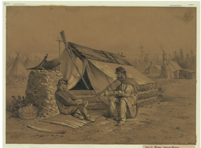
Fig 2. Home, sweet home. A scene in winter camp , Edwin Forbes, 1876.

the great army". The image [2], Home, sweet home. A scene in winter camp , depicts two Civil War soldiers, one playing a cigar box violin 32 (although earlier sketch studies showing the same instrument are dated at 1865). Such instruments became fairly common in times of war. Nicholas Saunders notes that during the Great War, instruments of all kinds were made from scrap wood and metal (often the debris of war itself) by soldiers. 33 As with the early American settlers, the practice was a way of combating homesickness and raising morale by playing traditional folk songs, and images of defiant men forming small orchestras in the face of adversity were widely published in magazines and on postcards of the period [3].