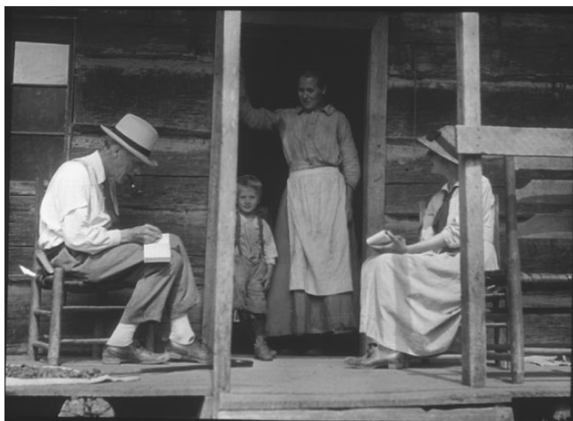
Fig 1. Cecil Sharp in Appalachia, ca. 1916.

Cigar box instruments originated in hard times, when many people had very little in the way of material wealth, or where they faced significant hardships. It is not surprising then, that the first known image of such an instrument appeared in 1876 in Edwin Forbes' collection of drawings "Life studies of