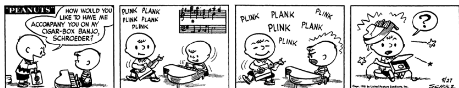
Fig 4. Peanuts Cartoon strip by Charles Schulz, 1951. Courtesy of the Charles Schulz Foundation.