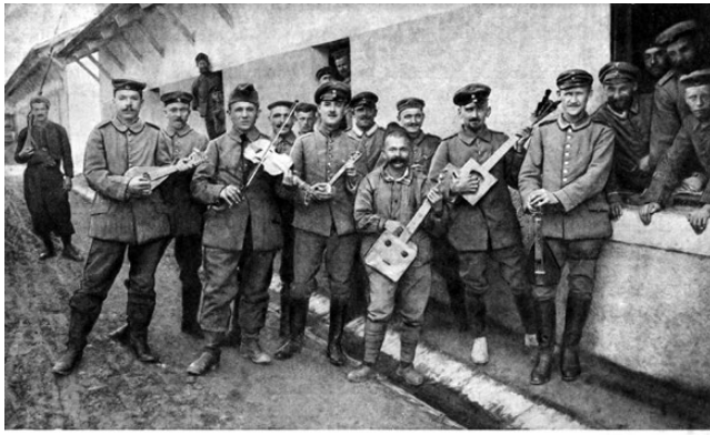
Musik deutscher Gefangener im Lager von Tizi-Ouzou (Algerien).