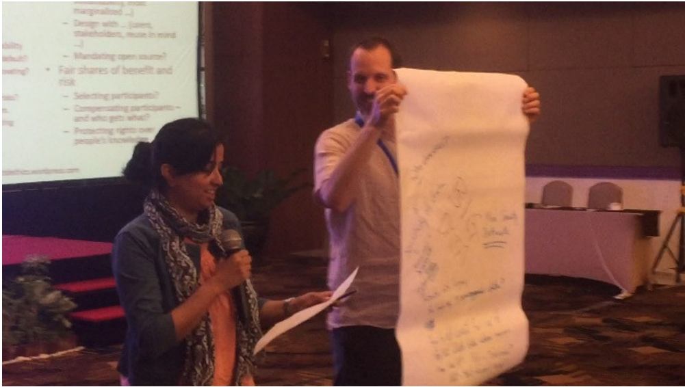
Reporting back from group discussions