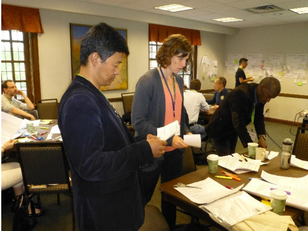
Reviewing and selecting texts from existing standards documents