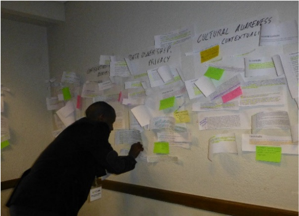
Reviewing and selecting texts from existing standards documents