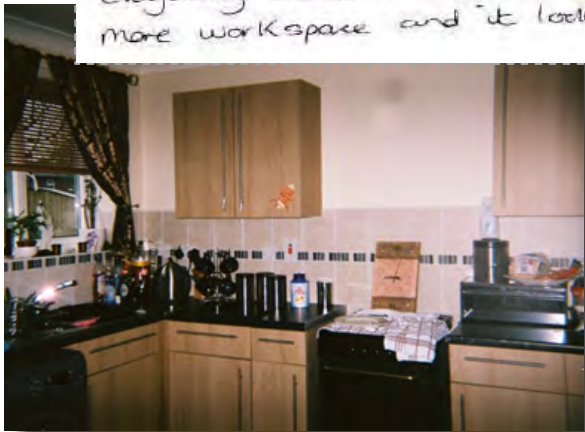
(Colleen, resident photographer, Belle Vue, year 3)

I took this photo because I like the kitchen as it's very modern and I was able to choose everything down to the last detail. I also have more workspace and it looks a lot bigger