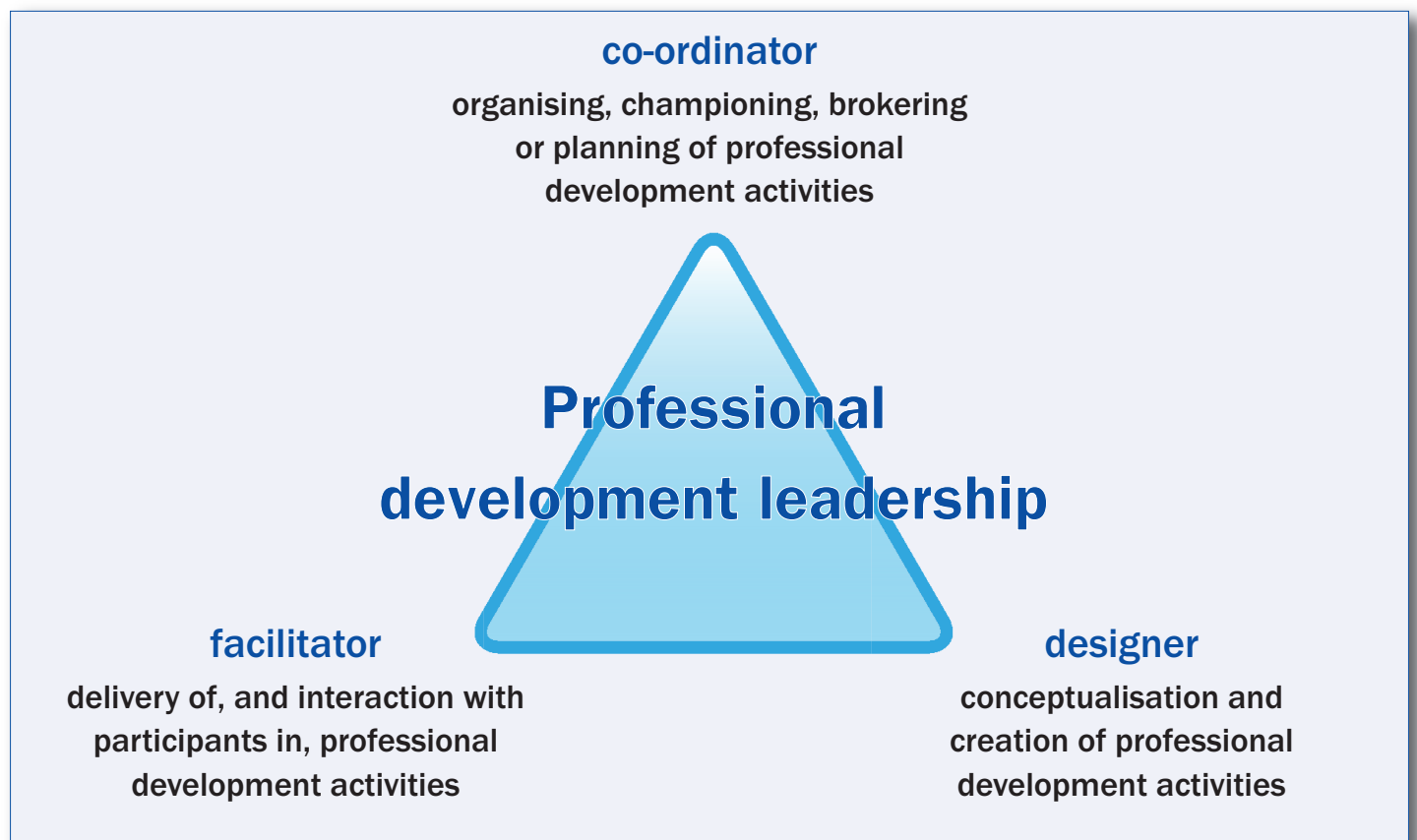
Figure 1. Model of leadership of professional development: three roles.