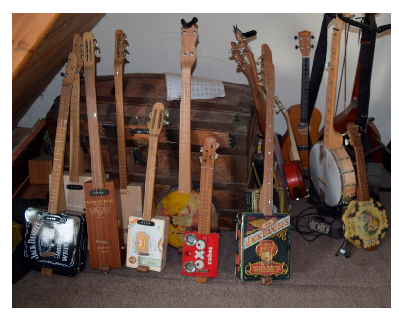
Figure 1. A selection of "cigar box guitars", canjos and ukuleles constructed from cigar boxes, various other wooden boxes and tin cans made to commission by Spatchcock and Wurzill.

presented as a reactionary object driven by a desire for an alternative to mainstream consumption. Citing frustration with the excessive costs of some factory-produced instruments from mainstream companies and the unnecessary exploitation of precious, unsustainable hardwood resources the "Cigar Box Guitar Revolution" encouraged people to reclaim used materials, make themselves such instruments and to get out and perform with them in public. The scene rapidly grew and now cigar box guitar festivals are held across the whole of the United States. When the American blues player "Seasick Steve" appeared on BBC television in 2006, his promotion of these instruments initiated the cigar box guitar scene in the UK.