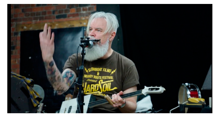
Figure 2. A still from the BBC Television Documentary "Cigar Box Blues: The Makers of a Revolution".

interviewed. This was not by choice, but because despite all efforts other female makers were not located. Taken along with the similarities of ages of those interviewed, this reinforced the initial view that this activity is largely dominated by middle-age men from a middle-class background.