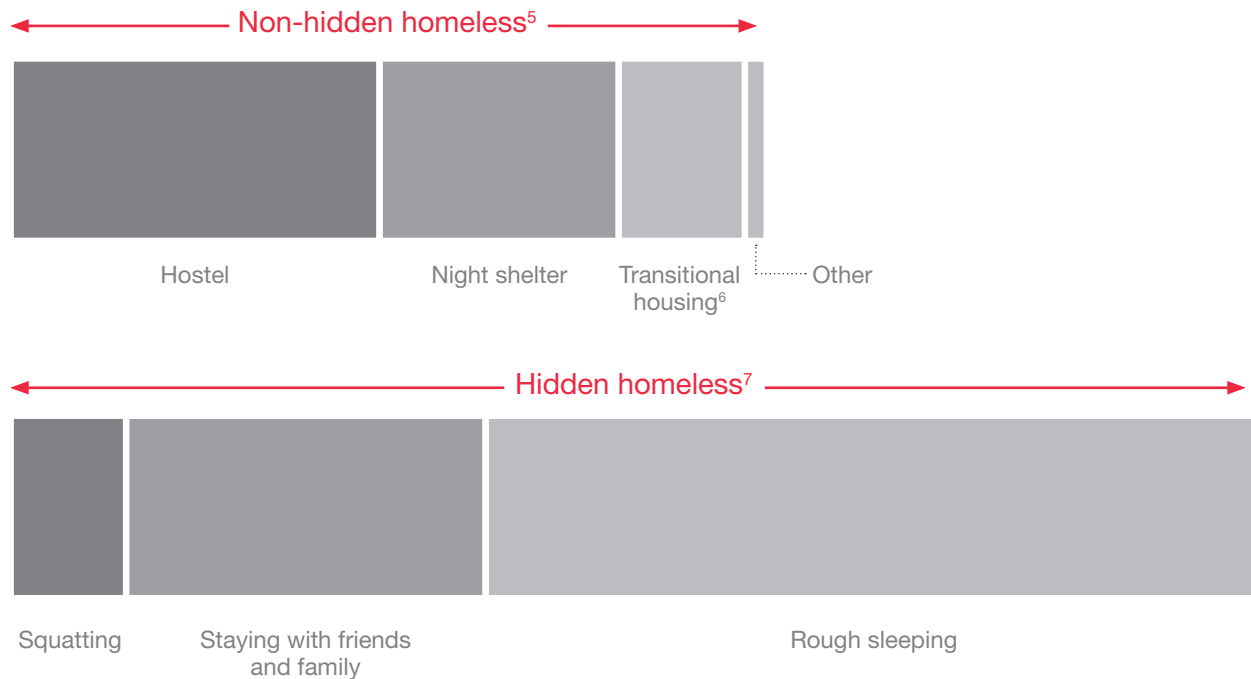
Figure 1 – Scale of hidden homelessness (where single homeless respondents spent the previous night) 4