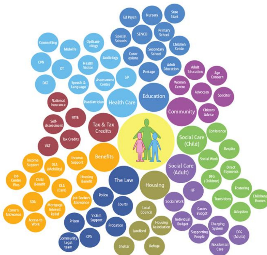
Figure 2.1: Service complexity (Duffy & Hyde, 2014)

In mapping the type and location of specialist support available for women who experience multiple disadvantage in England and Wales (Holly, 2017), researchers came up against many of the barriers that women face when trying to identify services that may be able to assist them. This included not knowing the right questions to ask to get the answers they need; being over-reliant on the knowledge of the person they ask; not knowing whether they meet the referral criteria; and not knowing how good the service is or whether it still exists. All these barriers are amplified for women at a time of crisis. Overall, the mapping of services currently available to women highlights how the system further disadvantages women by trapping them within a maze – a confusing jumble of paths that often lead nowhere or that give multiple and competing solutions to different points – rather than supporting them to move along and out of the labyrinth of difficulties that characterise their lives. Sharpens (2018) study revealed a feeling among women with multiple needs that services can often re-traumatise women by the lack of joined-up approaches, causing them to constantly re-tell their stories to multiple practitioners.