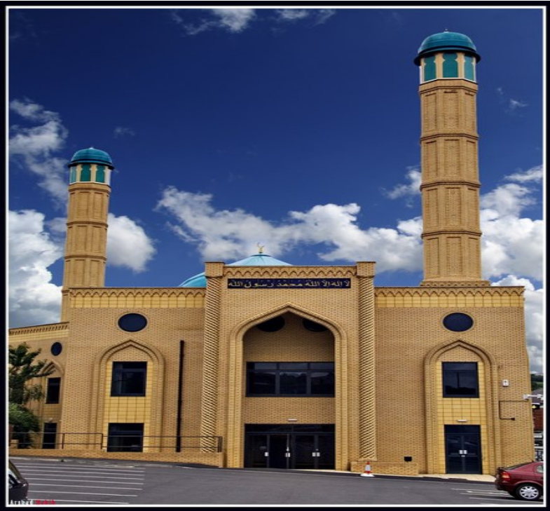
Figure 2: The Contemporary Madina Masjid and Sheffield Islamic Centre