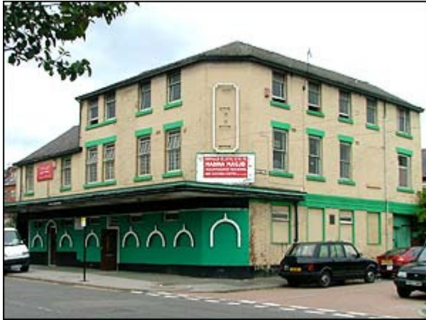
Figure 1: The Previous Sheffield Islamic Centre on the Wolseley Road site

The initial application for planning permission for the new mosque was developed and submitted in 1997-1998. The construction of the new mosque building began in September 2004. All of the funds for the new building have been raised by donations from within the local community- the mosque has not received any public subsidy. At the beginning of construction approximately £500,000 had been raised (out of total estimated development costs of £3.5m).