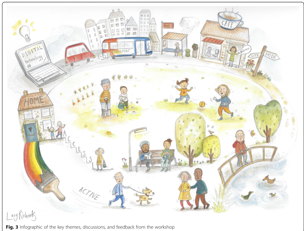
Fig. 3 Infographic of the key themes, discussions, and feedback from the workshop

included the development of technologies that address ‘hazard awareness’ (e.g. pedestrian safety). As well as being used for safety, assistive technology can affect where and how people live for example, driverless cars and smart homes [38]. Technology can also be used to reduce social isolation [45] and can improve care and quality of life [46], yet concerns were also identified around privacy, monitoring and digital exclusion.