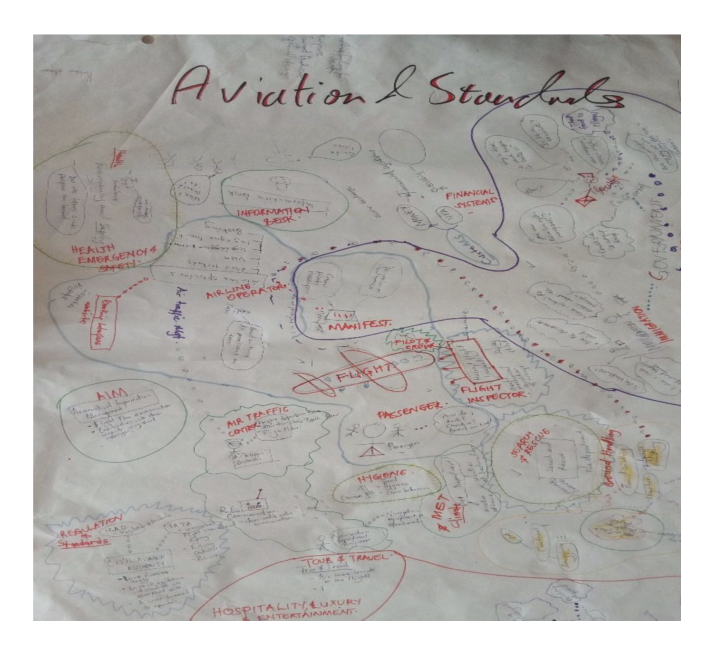
Figure 1. Sample: Rich Picture of the Aviation Operations Ecosystem Team.

they got stuck with a question or were lacking background knowledge. Over the course of a few hours, they worked their way through the dimensions, engaged in vivid discussions with each other, and drafted their initial versions of the Sustainability Awareness Diagrams.