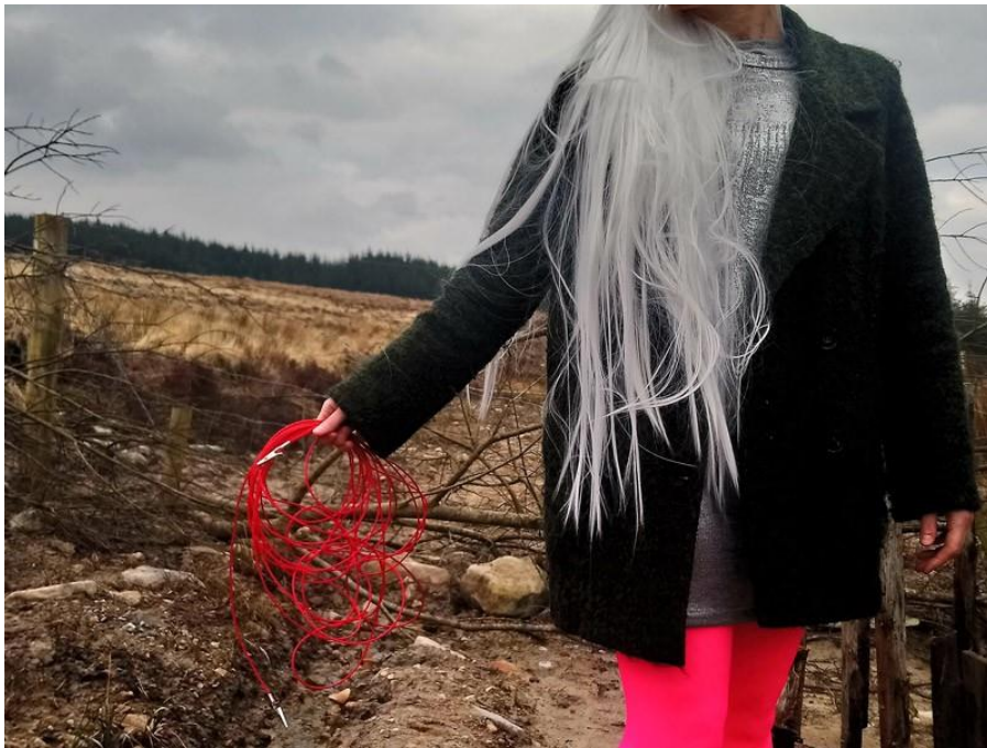
Figure 8: The Territories of Eile #4 Bog, audiovisual film, forthcoming 2020, film still. [by a place of their own]

visual arts. Bog peatland are among the most valuable ecosystems on Earth: they have a critical role for preserving biodiversity, provide safe drinking water, minimise flood risk and help address climate change. However, in Ireland, as elsewhere, they have been drained and neglected over the years, threatened by water extraction, agricultural use, peat extraction, private forestry, industrial uses and house building. Ireland is a signatory to the international Ramsar Convention (1971) and supports the three main aims of the convention (the wise use of wetlands, ensuring conservation and vigilance in planning; to designate suitable wetlands and, third, to cooperate internationally). As such, the bog, as borderland, is an incredibly rich and evocative site of material-discursive entanglement.