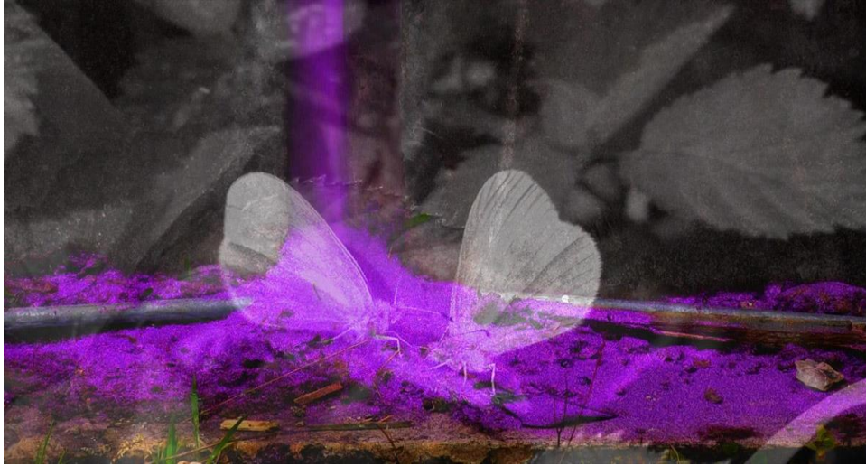
Figure 5: The Territories of Eile, audiovisual film, 2018, film still. [by a place of their own]