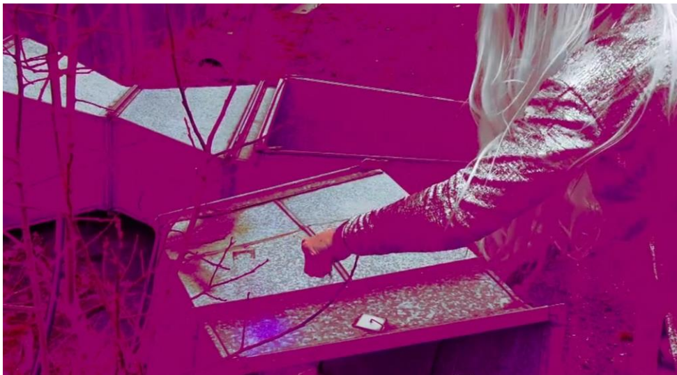
Figure 4: The Territories of Eile, audiovisual film, 2018, film still. [by a place of their own]

performing a ritual with grains of brightly coloured granular material, pouring it in various ways across different objects (what seem to the viewer to be discarded building components - including ventilation ducts and re-bar, but all now in unusual configurations and encroached by plants and moss). The material-discursive forces of both the existent, traumatised border and that which is fictionalised in the film, are harnessed and explored by moving through different scales; the border as global phenomena and the specificity of the Irish/UK border through falling grains of dust. Other scalar entanglements are between the site and the body, and, via the sonic aspect of the film, the cosmic and the planetary, as it folds in recordings from NASA of the planet Saturn.