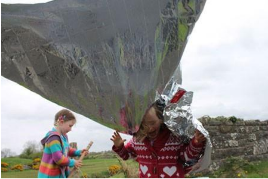
Figure 2: Experiment #2, The Eile Project, 2017 [by a place of their own]