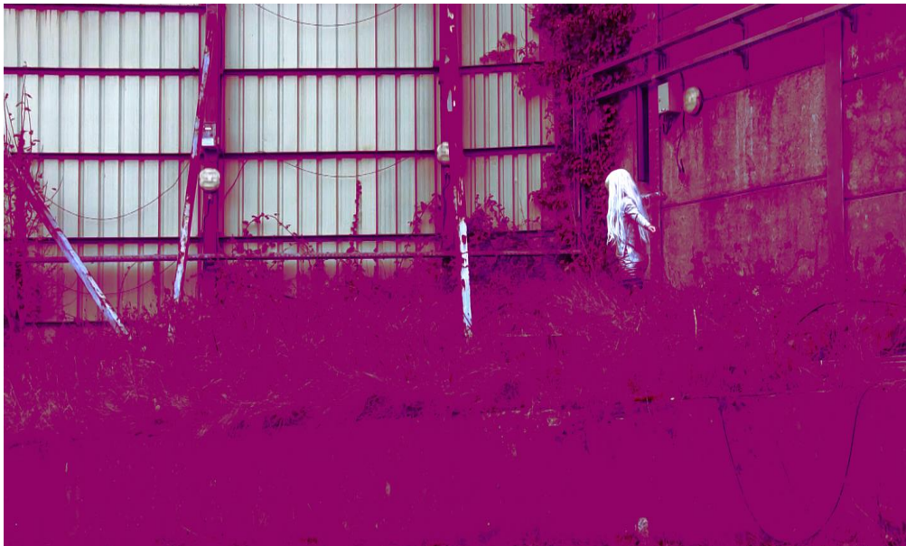
Figure 7: The Territories of Eile, audiovisual film, 2018, film still. [by a place of their own]

frequently the subject of shooting and bombing attacks, became a "tangible symbol of the Peace Process." 49 When we came to perform and film in this village, the long abandoned Barracks was still intact, and had been for sale for some time. The barbed wire, huge gates and walls, and the many lifeless CCTV cameras which stared down at us, acted as reminders of the site's history of state surveillance and control. Many of the doors were boarded up and there was all manner of rusted metal, stone and old electrical debris strewn across the site. The walled and gated areas had become a shell that was haunted by a not-too-distant past of bloody violence.