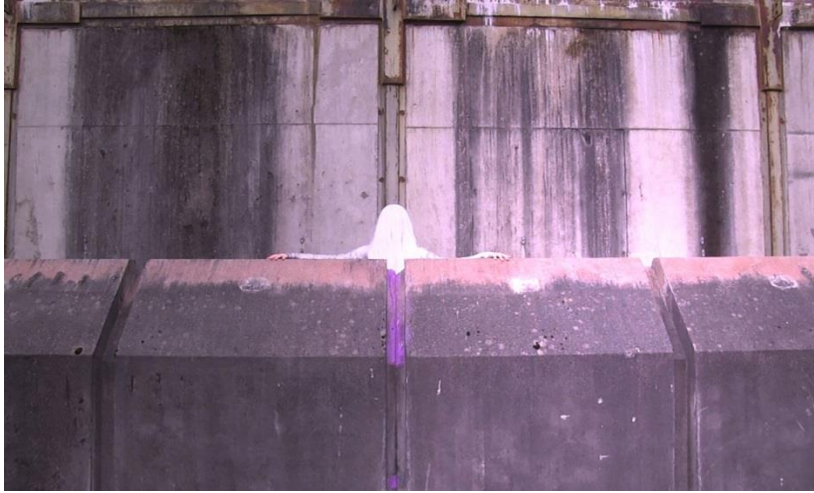
Figure 1: The Territories of Eile, audiovisual film, 2018, film still. [by a place of their own]