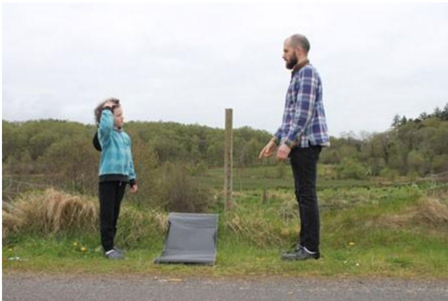
Figure 3: Experiment #2, The Eile Project, 2017 [by a place of their own]

The subsequent Experiment #3, included a site-based performance / spatial intervention on the River Erne and in a disused former RUC barracks. Out of this performance / intervention emerged a film, The Territories of Eile , in which the central character of Eile is captured