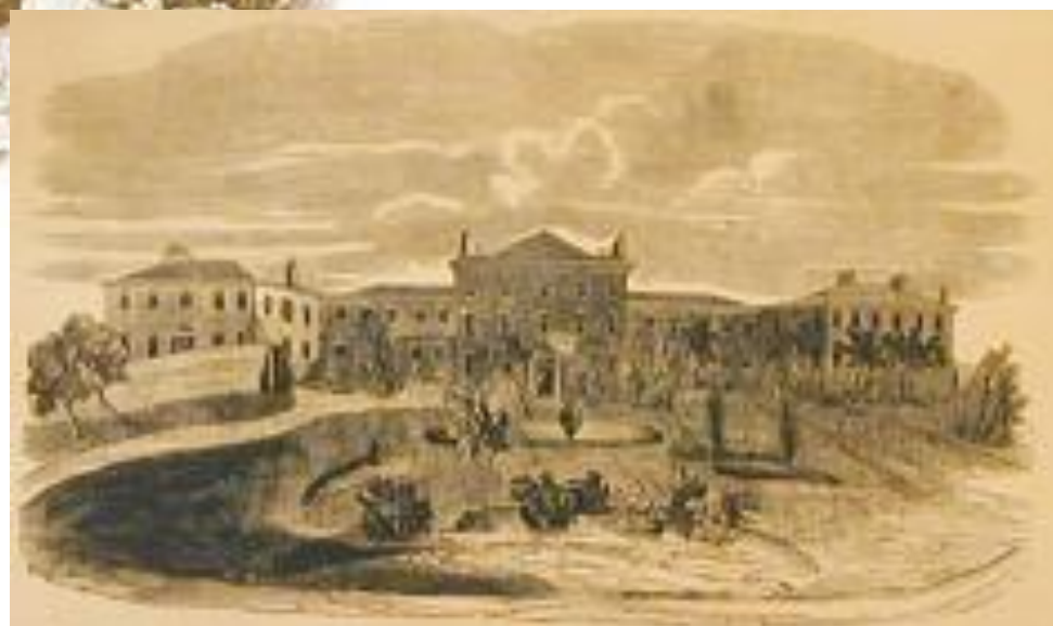
The Central Institute, near York