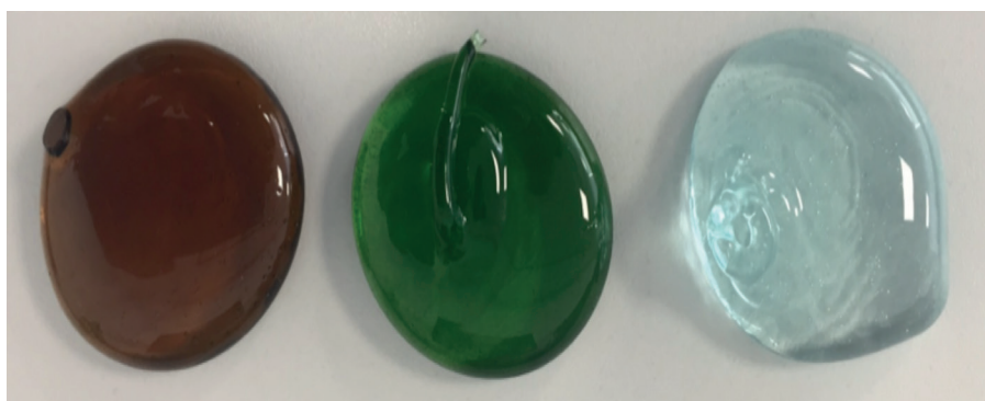
▲ Fig 2 Laboratory-manufactured amber, green and colourless glass samples produced from reformulated commercial container glass batches with biomass ash.

of local materials. In the Levant and Near East, ashes from halophytic plants from the Salicornia and Salsola genera were used, whereas in northern Europe wood ashes were used, primarily beech ( Fagus ) ash. These wood ash glasses are known as 'Waldglas', ('Forest Glass'). Wood ash glasses were found in the Carolingian Empire from as early as 800 A.D, and their industrial manufacture continued into the 18th Century.