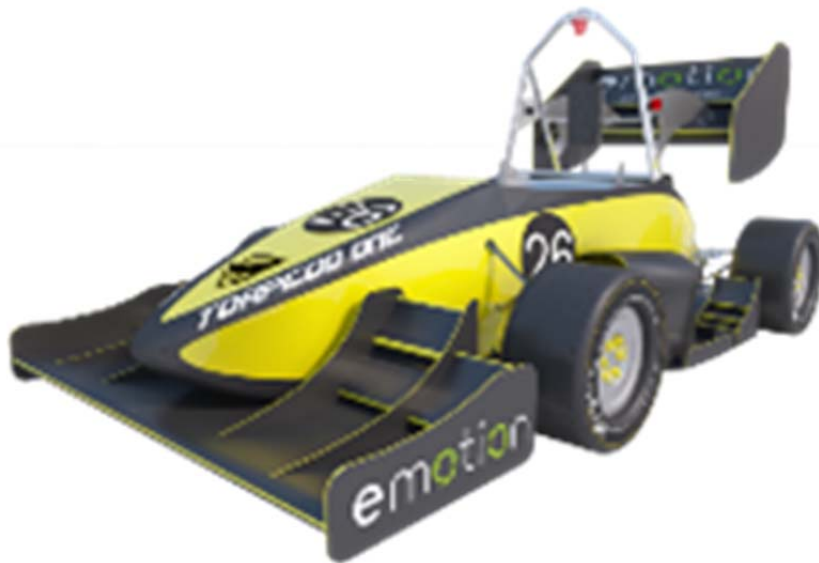
Figure 1: The Formula SAE vehicle "T-ONE".

Section 2 describes the vehicle model. Details regarding the torque vectoring algorithm are given in Section 3. Section 4 deals with the reference trajectory and the driver model. Preliminary results are presented in Section 5, and conclusions are in Section 6.