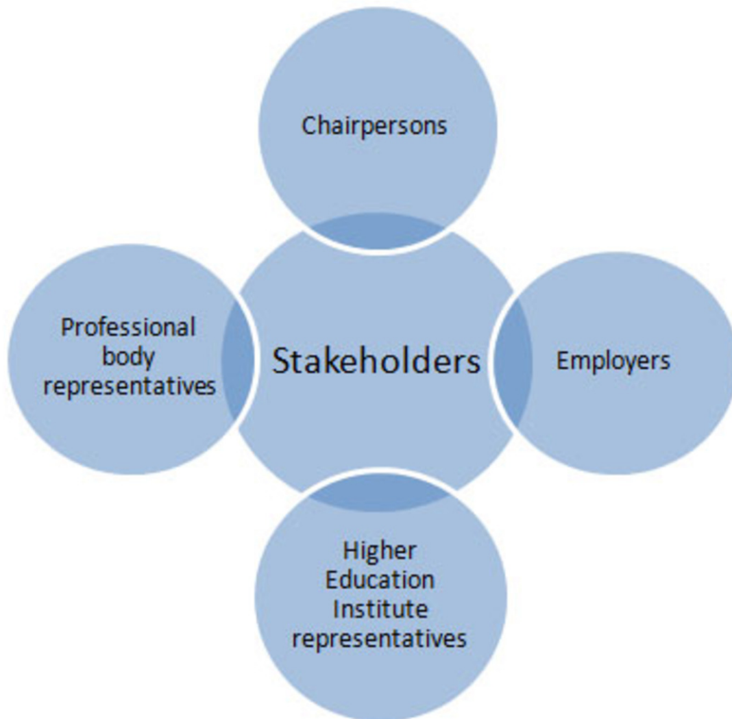
Fig. 1: Participants are drawn from the Trailblazer membership, which includes four stakeholder groups.