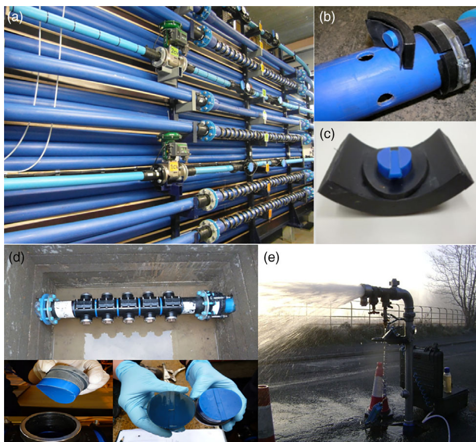
FIGURE 1 (a) Real-scale DWDS laboratory facility at Sheffield University, (b) PWG coupons are inserted along the pipe, (c) PWG coupons showing insert and outer part of the coupon. (d) Biofilm sampling devices used to sampling biofilm in situ during field work. (e) Flushing equipment used in real DWDS