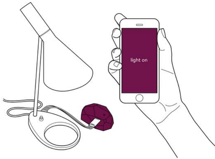
Figure 2: GPIO beacon controlling a lamp