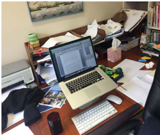
(Author 2, Photo 9)

There's a cap on the shelf to the right. A Sherlock Holmes cap. A flat cap, belonging to an ex-coal miner or manual worker. A practical cap, a cap-in-waiting for cold ears on winter afternoons, or travels to colder climes where the weather is unpredictable and rudely wet? Whatever. The cap is indubitably there, and it matters: it has a place and a position, though not necessarily one that humans might assign to it. The cap as 'vital player' within Author 2's home-workspace assemblage demonstrates 'the curious ability of inanimate things to animate, to act, to produce effects dramatic and subtle' (Bennett 2010, p. 6). The cap puts matter in motion, its material agency producing a 'living, throbbing confederation', albeit one with an 'uneven topograph[y], because ... power is not distributed equally across its surface' (Bennett, 2010, p. 23–24). This cap is not dead, dumb, passive matter. But, while posthumanism asks us to think and do differently in relation to other-than-human living things in the universe such that we are okay with questions like 'what's it like to be a bat?' (Nagel, 1974), we are not yet as comfortable with 'what's it like to be a table'? or a mousemat? or a cup and saucer? But why not? If, like us, you have ever dropped your