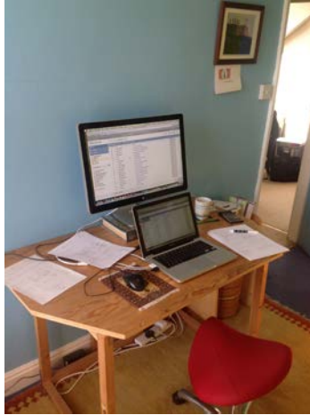
(Author 1, Photo 7)