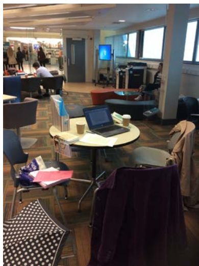
(Author 1, Photo 2)