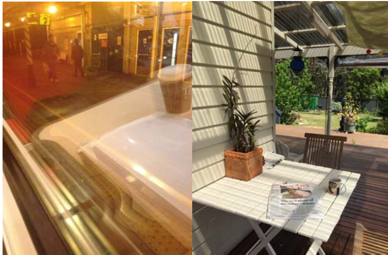
(Author 1, Photo 11)