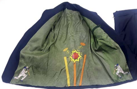
Figure 17. Inspired by the biography, life style and reputation of Len Hutton.