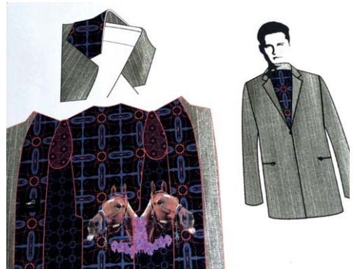
Figure 20. A humorous print symbolising the wearers inner rebellion to tradition and rules and conformity.

Controlled thrill seeking, rebellious and adventurous traits were identified in the TED man and covered through sports such as cross country skiing and shooting, in the example in figure 19 linking to James Bond, the ultimate fictitious British special agent, who lived life on the edge and was idolised by men and loved by women.