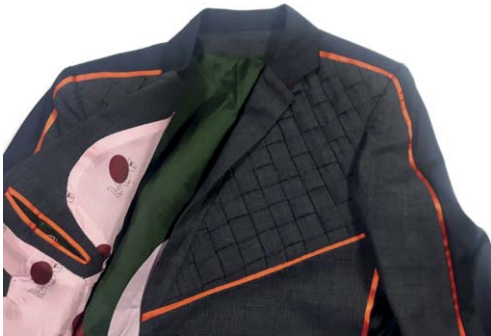
Figure 4. Combining creative cutting with digital technologies.