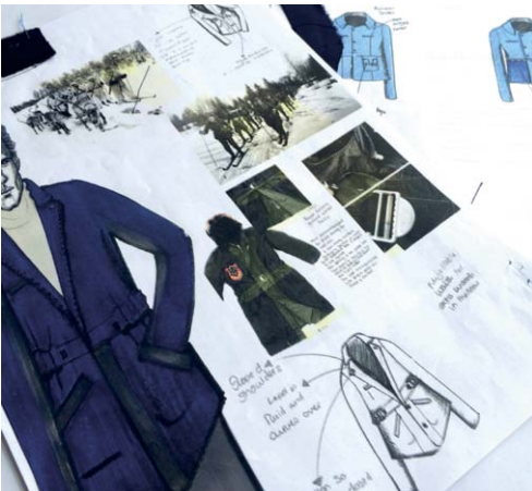
Figure 19. Exploring thrill seeking, rebellion and adventure.

the British formula one champion James Hunt, the horse rider and wrestler Harvey Smith (figure 16), superbike champion Carl Fogarty, British cyclist Sir Bradley Wiggins and (figure 17) the cricketer Len Hutton the highest scoring batsman in test cricket. Inspiration was not only drawn from the sport itself but also biographies, life style analysis and reputation. Learners in this instance linked the desire to succeed in the consumer with icons who were aspirational and excelled in their sport.