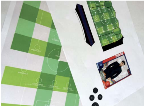
Figure 2. Looking beyond the obvious.