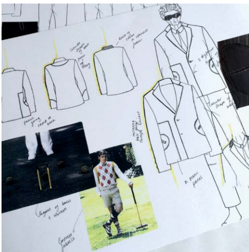
Figure 11. Golf to focus on competitiveness, patriotism and rivalry.

Hero worship was a popular narrative with inspiration drawn from iconic British sports personalities, to include