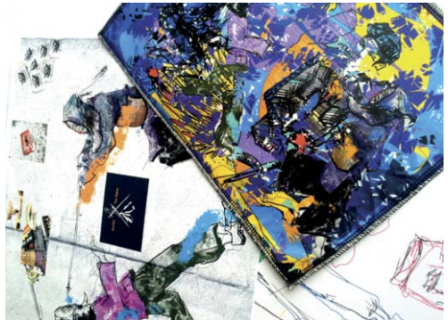
Figure 7. Handpainted lining using paint inks and dyes.