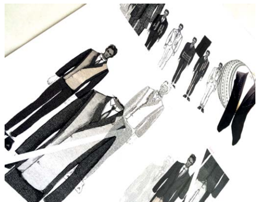
Figure 21. Team sports and the Ashes.