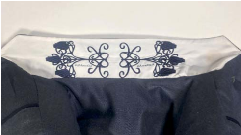
Figure 3. Digital embroidery used to add decoration to the jacket undercollar.