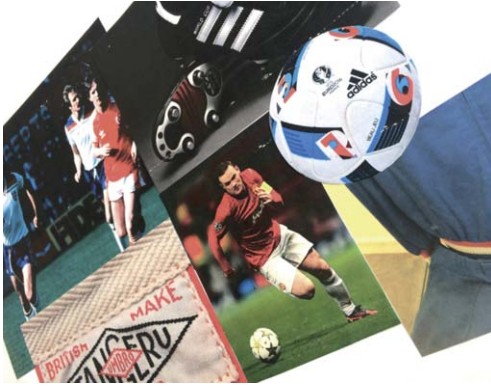
Figure. Generating primary and secondary research.