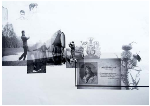
Figure 12. Exploring golf through its historical origins.

Woods. Although learners on occasions chose the same sport, the chosen avenue for exploration created differing narratives. While Golf is focusing on competitiveness, patriotism and rivalry, in figure 12, (below) we see how golf is explored through its Royal and military heritage, with a focus on the banning of the sport by King James II in preference of archery to increase military excellence in war. The narrative also explored the secret up take of the prohibited sport by the upper classes and Royalty, creating exclusivity and divide in the social class system.