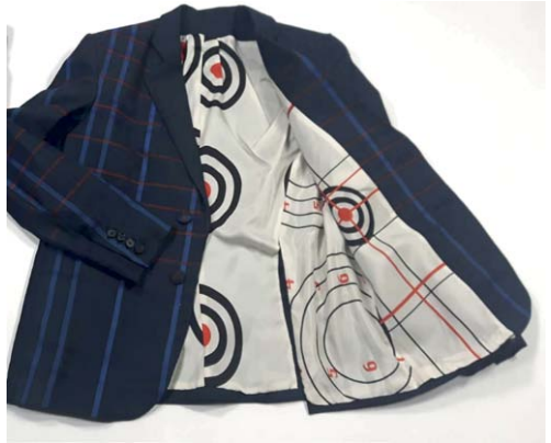
Figure 5. Jacket lining enhanced by applying both digital and sublimation printing processes.