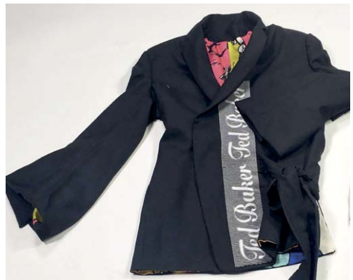
Figure 14. Embroidery applied to create an optical illusion effect, symbolising restraint, control and things not always seeming what they first appear.

In figure 15, spiritualism, war, conflict and patriotism is also explored in the contact sport of Mia Tia and translated through the lining print and embroidered literal narrative on the inside paneling of the jacket. The floral print is a sacred plant indigenous of the natives who popularized the sport.