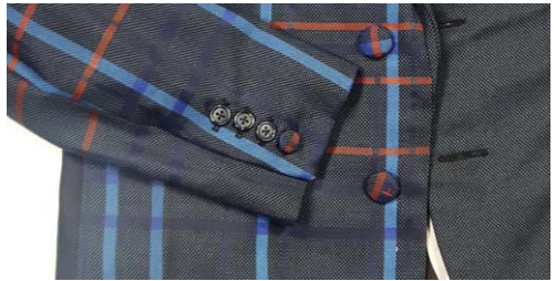
Figure 6. Screenprint applied to the external of the jacket and buttons.