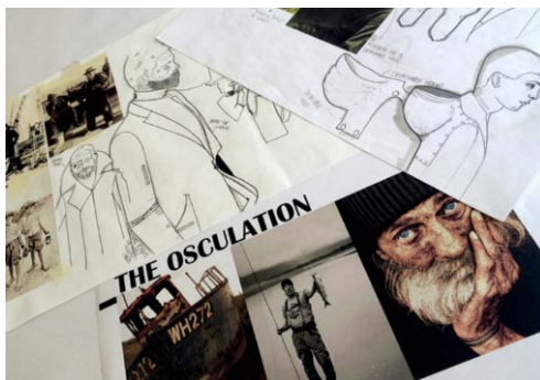
Figure 9. Paying homage to fishing.

Figure 11 linked TED's origins back to Scotland and the traditional and favored sport of Golf. This narrative focused on the Ryder Cup and Rivalries between Europe and the USA, particularly that of Rory McElroy and Tiger