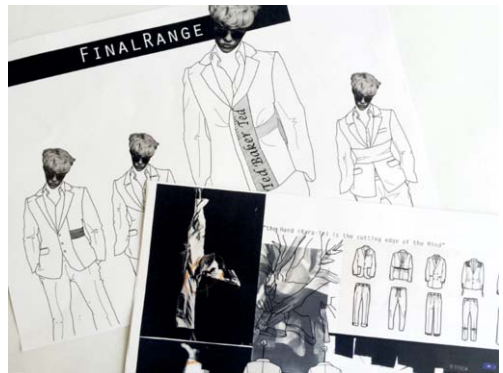
Figure 13. “Fight or flight” and male behaviors.

Figures 13 & 14 paid homage to combat sports and looked into “fight or flight” and male behaviors particularly when threatened or provoked. Here the learner was interested in self control in confrontation and rising above the situation i.e “Being the better man”. Traits identified within the brand ethos and consumer personalities. Investigating and analysing Taekwondo and spiritualism resulted in a more relaxed cleaner cut tailored aesthetic with embroidery creating an optical illusion effect, symbolizing the idea of restraint, control and things not always seeming what they first appear.