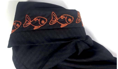
Figure 8. Handembroidery applied to the inside of the trouser waistband creating a more artisan and crafted aesthetic.