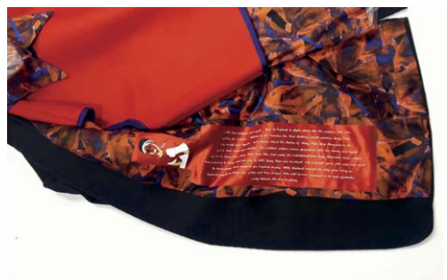
Figure 15. Embroidered narrative on the inside paneling of the jacket.