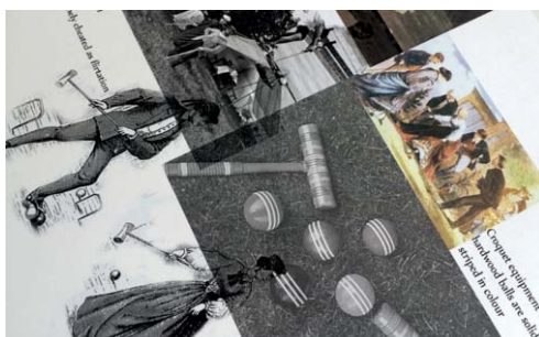
Figure 10. Crochet used to connected to the brands unswerving attention to detailing, accuracy and quality.