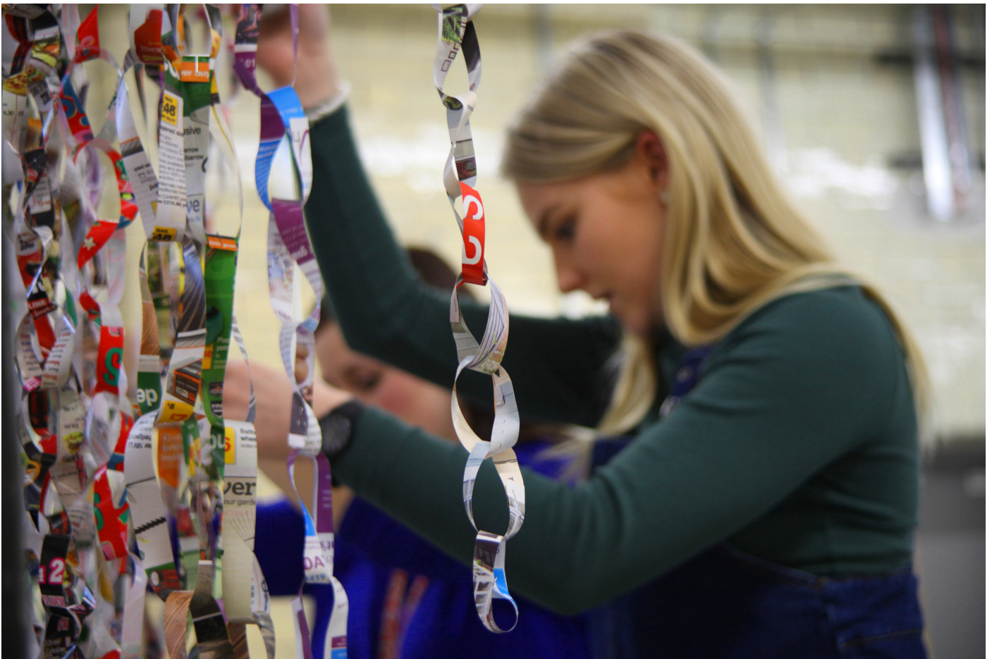
Installation prototype assembly (Shankar 2016).