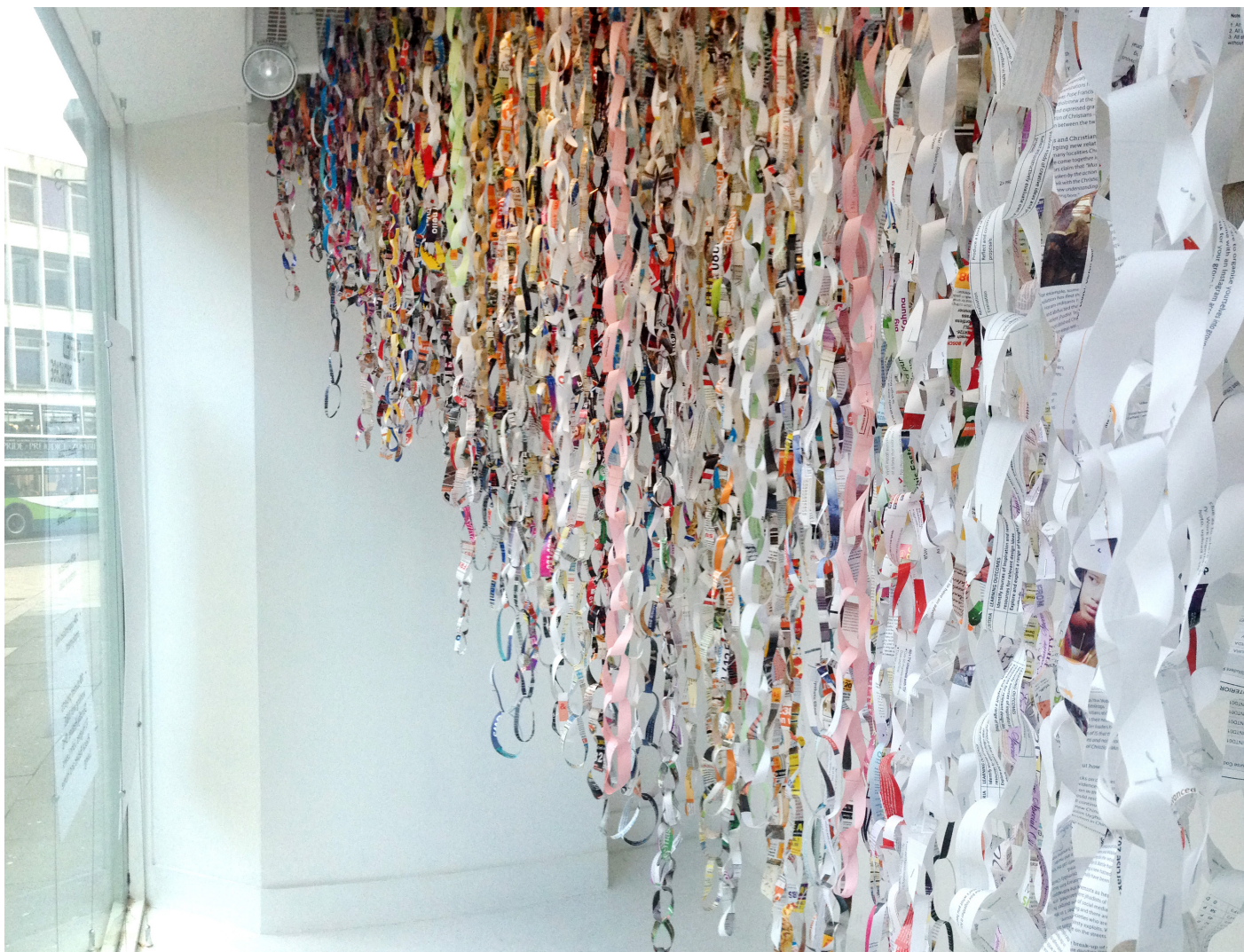
Highlighting the subtle gradient change from office waste to junk mail (Vallance 2016).