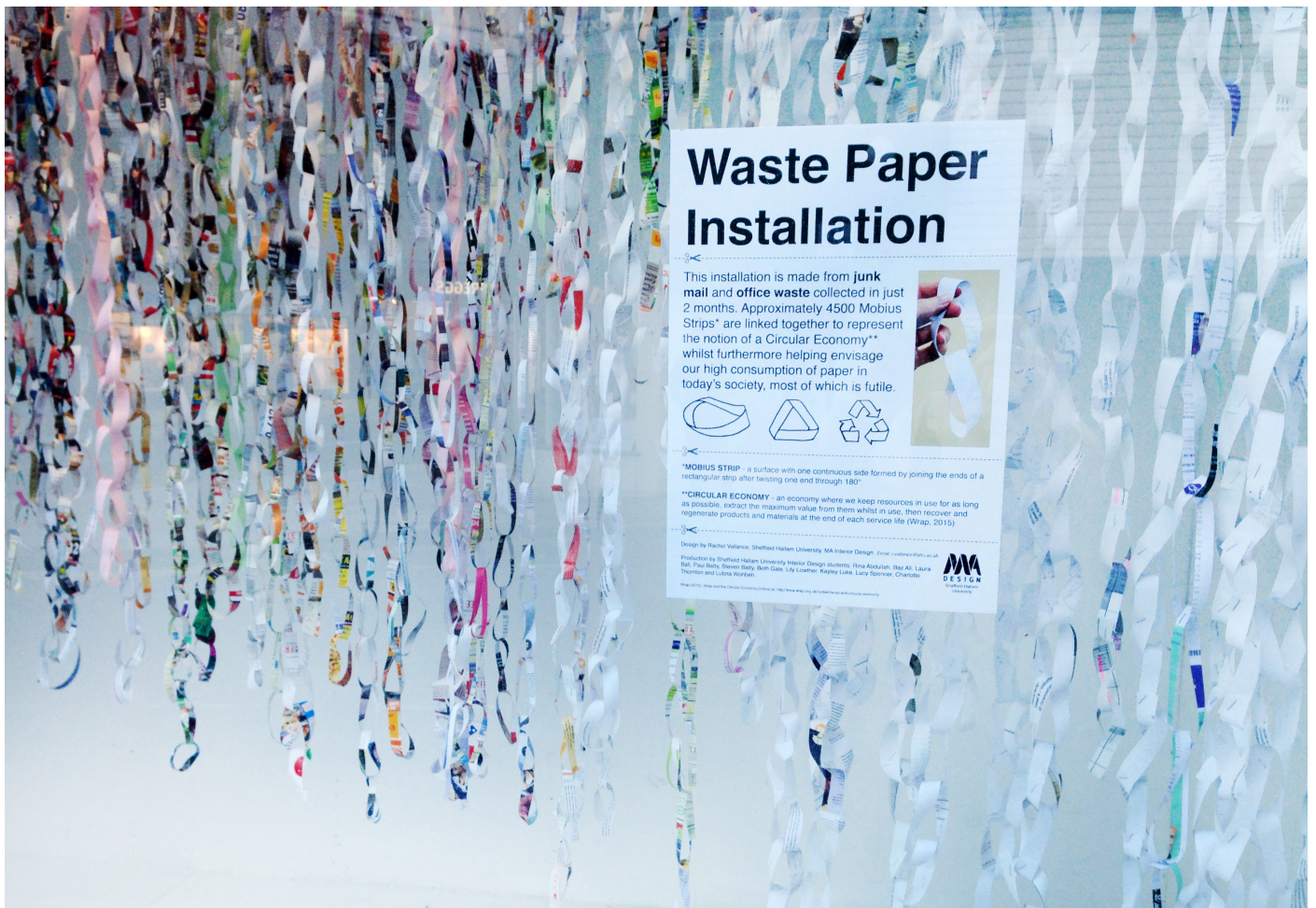
View from the window showing the synopsis for the viewer (Vallance 2016)