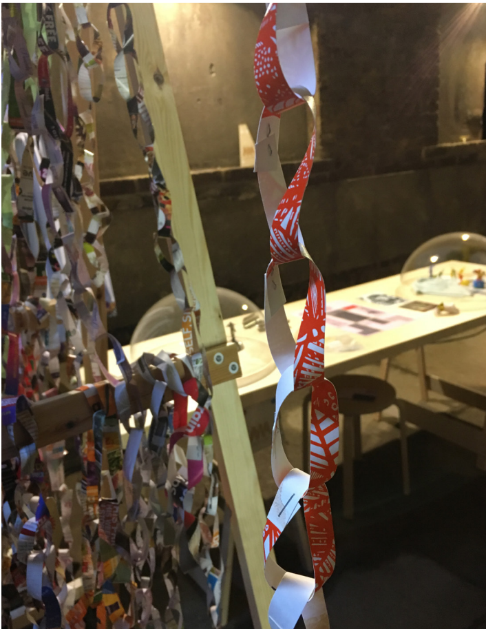
Close up of waste paper mobius strip (Vallance 2016).