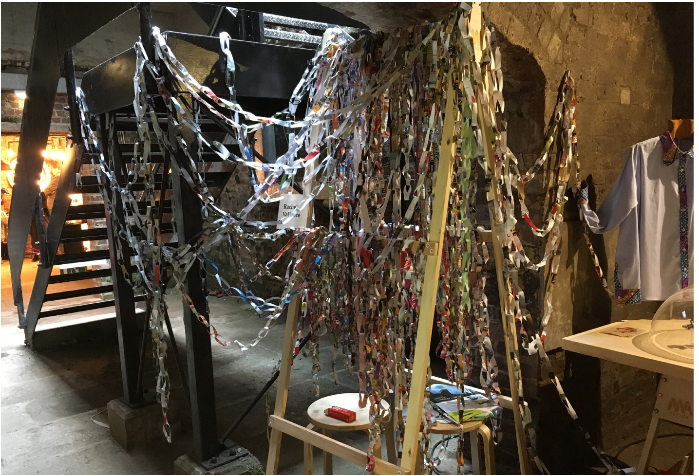
Clerkenwell Design Week, Platform venue (Vallance 2016).