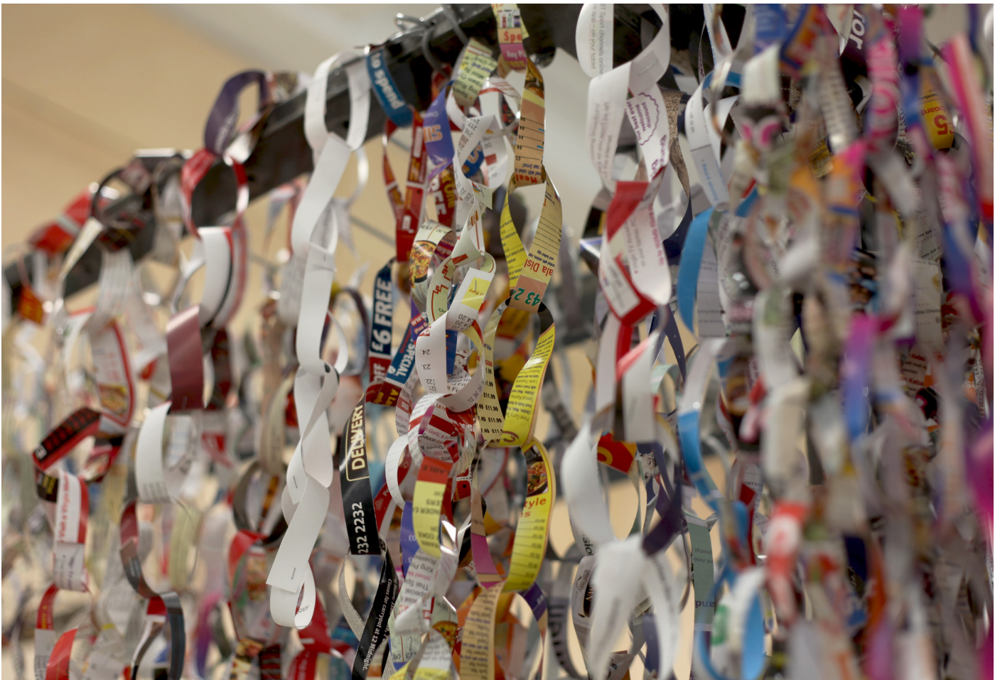
Installation prototype (Shankar 2016).