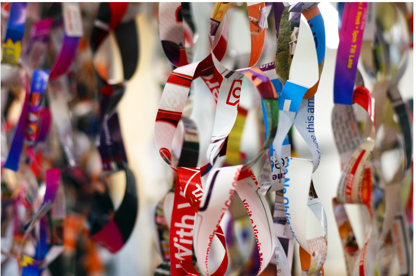
Close up of the paper chains highlighting the origin of the junk mail (Vallance 2016)