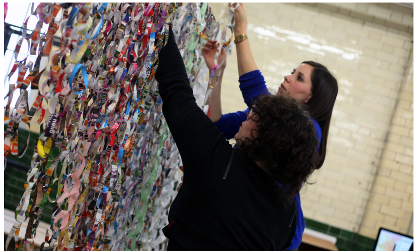
Installation Prototype (Shankar 2016).