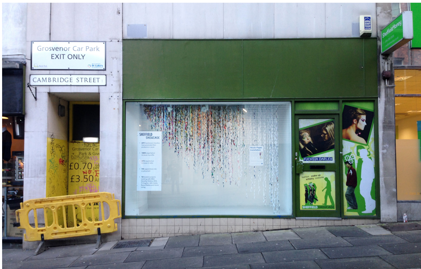
Precious Paper installation on Cambridge Street, Sheffield (Vallance 2016)