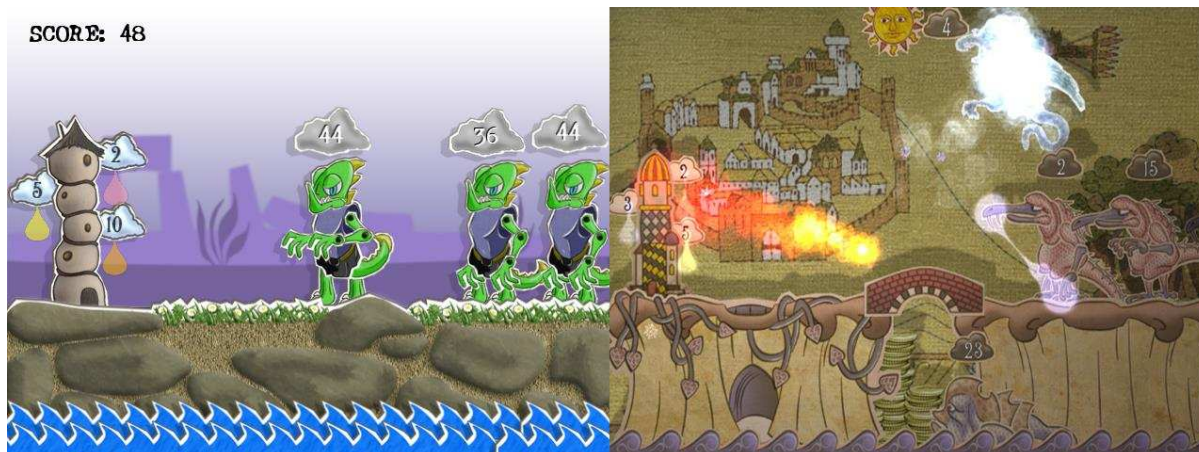
Figure 2: Outnum3r3d Prototypes. GameMaker (left) and Nintendo Wii (right)

The remaining design elements introduced repeated addition and multiplication as means of creating monsters to defend the castle in a similar vein. This meant that addition, subtraction, multiplication and division were all embodied as part of the game's core mechanics. Players could now combine mathematical strategies in order to dispatch enemies in different ways, resulting in different levels of tactical gameplay dependent on the player's conceptual understanding of division (i.e. being able to identify appropriate multiples of the available divisors). The final feature which was added to the game was an octopus-like end of level boss whose tentacles were all prime numbers which (therefore) couldn't be defeated using division attacks.